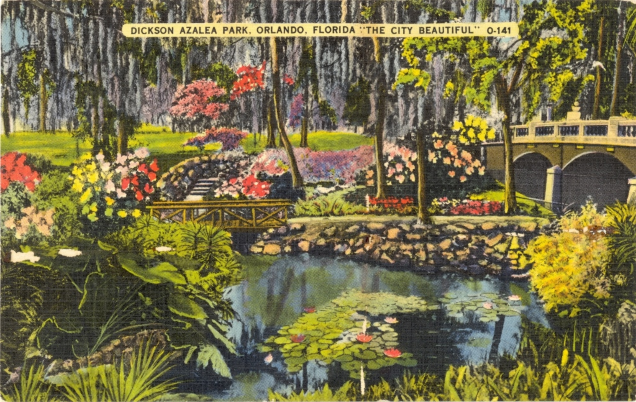
DICKSON AZALEA PARK, ORLANDO, FLORIDA "THE CITY BEAUTIFUL" O-141