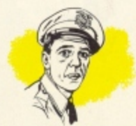
Don Knotts Deputy of the Andy Griffith Show, says "I love the Mer- maids at Weeki Wachee!"

THE THRILLS OF SKIN D where you'll view the world windows 2½ inches thick. water caverns and mounta of synchronized beauty and