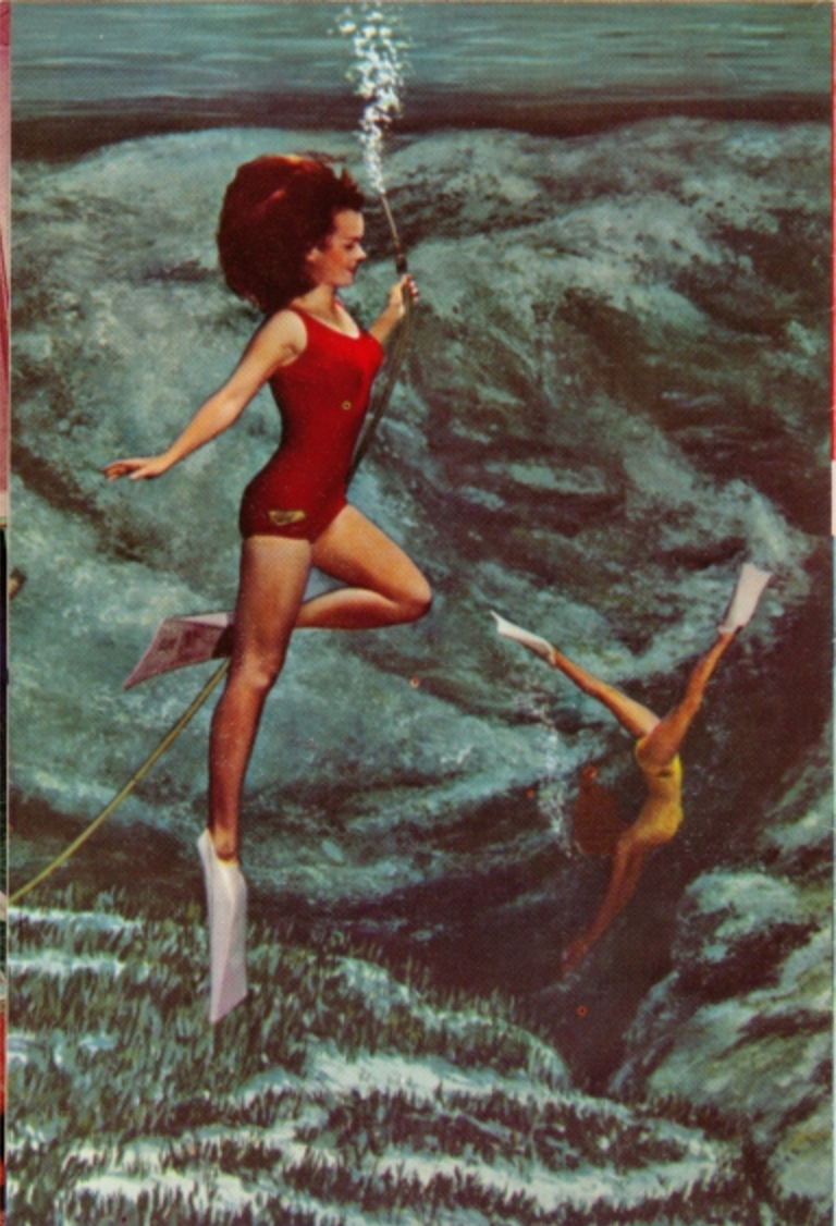
At each performance a lovely mermaid attempts a 117 foot deep dive into the depths of Florida's famous underwater grand canyon.