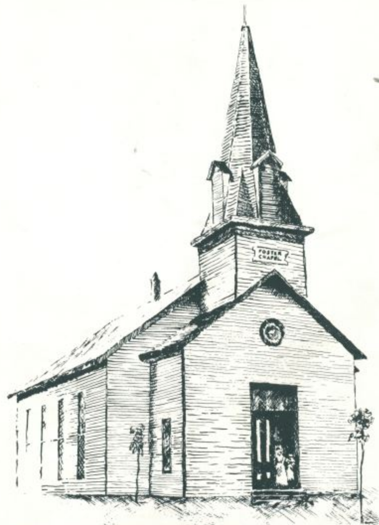
ORIGINAL FIRST METHODIST CHURCH OF OVIEDO