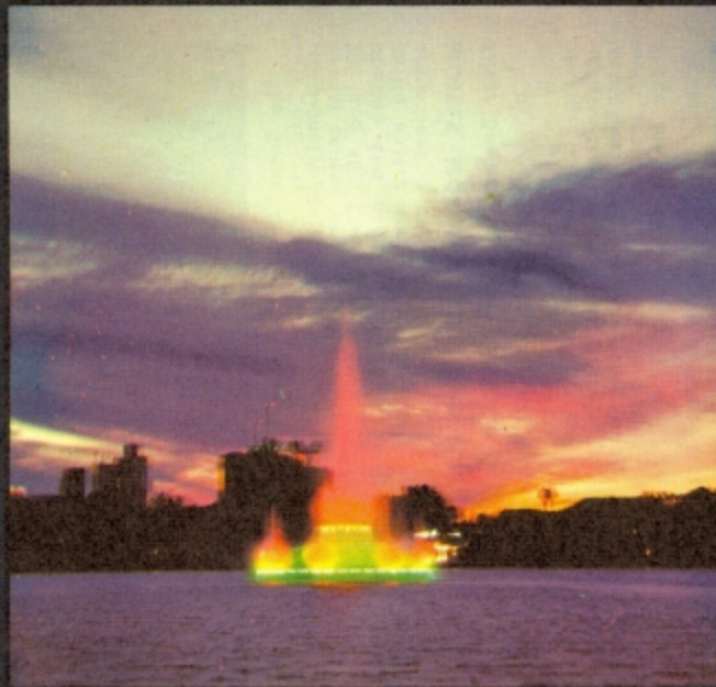
"Centennial Fountain" Eola Park, Orlando