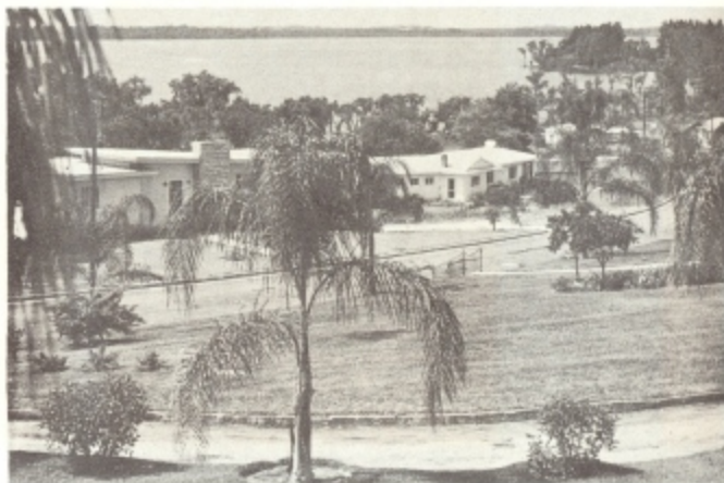
RETIREMENT HOMES AT CLERMONT

CLERMONT, FLORIDA —Beautiful, progressive—the 'Hub' of Florida. This hospitable city is small enough to be friendly, yet large enough to have excellent schools; civic, cultural and recreational facilities. It has much to offer light industry.