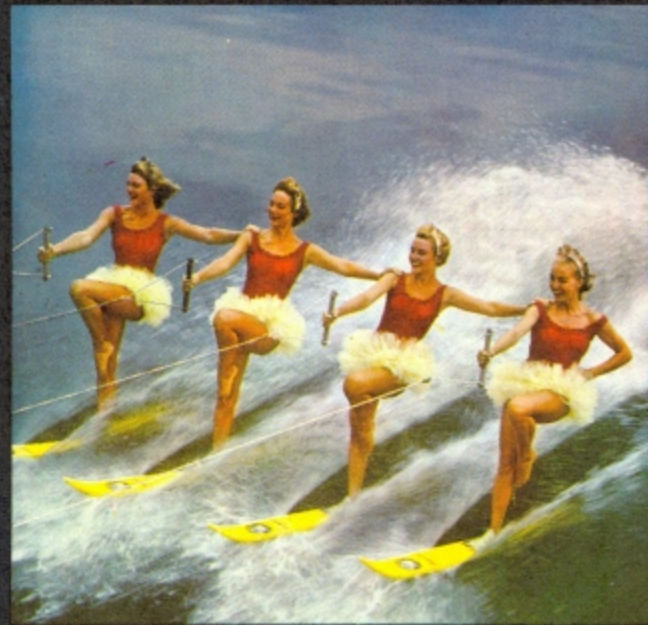
"Aqua Maids at Beautiful Cypress Gardens"