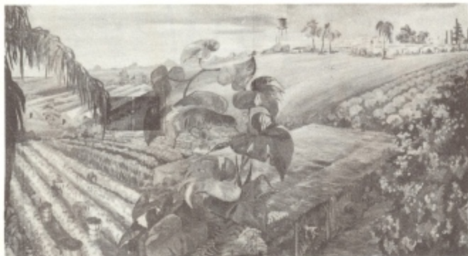
REPRODUCTION OF PAINTING IN LOBBY OF STATE BANK, APOPKA

"The Fern City of Florida," is located in Northwest Orange County, 12 miles from Orlando, near the banks of Lake Apopka, second largest lake in Florida, the home of the famous large mouth black bass. Apopka has oldest Masonic Lodge in State, having been built with slave labor in the year 1858.