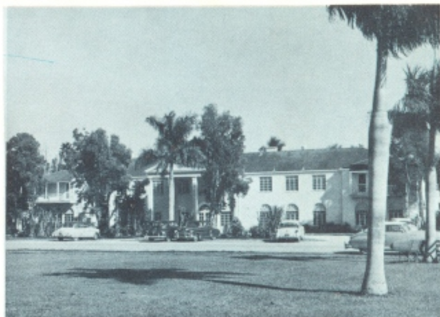
THE CLEWISTON INN, CLEWISTON

America's Sweetest Town, the Queen City of Florida's Sugar Bowl on the south shores of Lake Okeechobee. Attracting more vacationists each year due to its friendly people, its location, unexcelled year-round fishing, excellent hunting in season, fine golf course and ideal climate. Excellent accommodations.