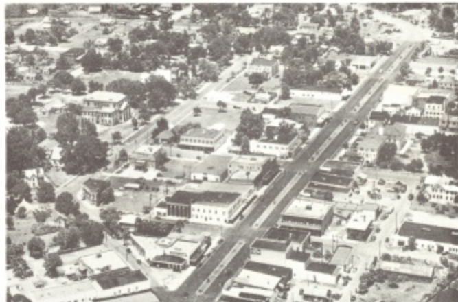
DOWNTOWN BUSINESS DISTRICT OF KISSIMMEE