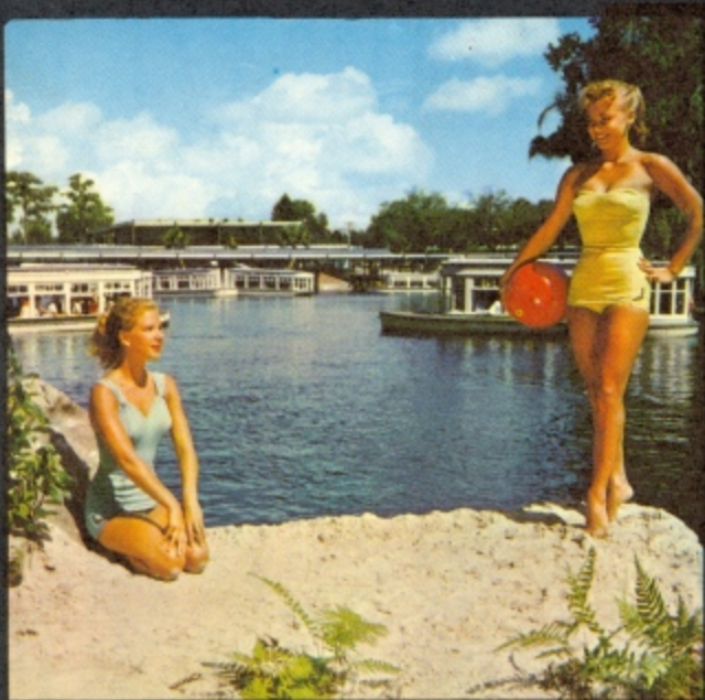
"Beauty abounds at Florida's Silver Springs"