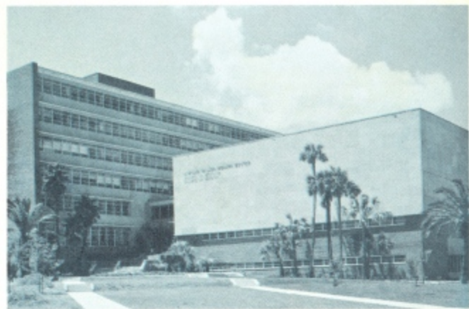
J. HILLIS MILLER HEALTH CENTER UNIVERSITY OF FLORIDA

GAINESVILLE is the natural trading area for north central Florida. There are 1600 farms with a diversity of agriculture which provides a well rounded economic base. The county offers outstanding hunting, fishing and boating facilities. Home of the University of Florida, Center for Science, Medicine and Education. An ideal place for retirement.