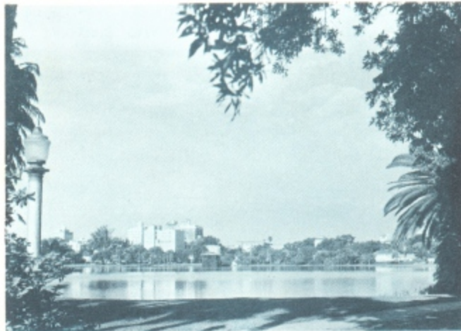
ORLANDO—"THE CITY BEAUTIFUL"

Golf is a drawing card for visitors and several tournaments are played here, including the National Pee Wee Championships.