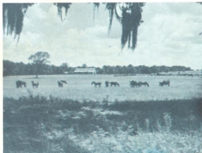
The Scene At One Of Ocala's Thoroughbred Horse Farms

County seat of Marion, a thriving trade, distribution and tourist center on U. S. Highways 27-301-441 and State Highways 200 and 40. Central to an area noted for its hunting, fishing, boating and camping facilities; and its horse farms and beef cattle enterprises. Silver Springs — the greatest-of-all Florida attractions is nearby.