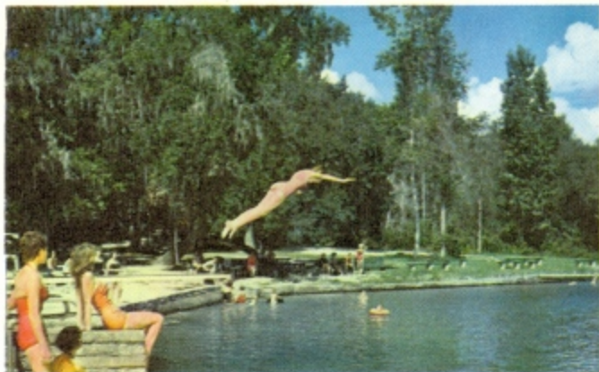
Transparency is of Rock Springs, Kelly Park, Orange County.

Land of citrus groves, farms and cattle ranches, set among hundreds of scenic lakes, noted for fishing, boating and water skiing. Seven county parks also provide picnic and recreation facilities. Covers an area more than 900 square miles with a population of nearly 250,000. Offers much to the visitor, sportsman and prospective homeowner.