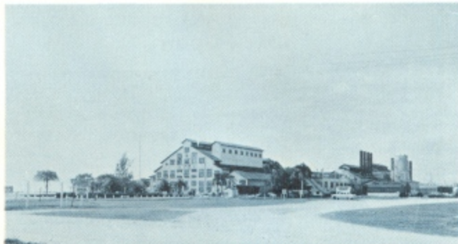
SUGAR HOUSE OF UNITED STATES SUGAR CORPORATION — This is the largest raw sugar house in continental United States. Over 35,000 visitors annually take advantage of the free guided tours through this plant from November 1 through April.