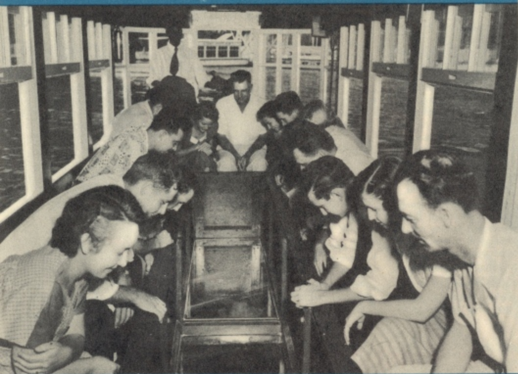
Viewing The Underwater Wonderland