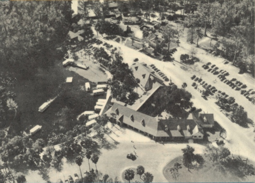
Air View Of Florida's Largest Attraction