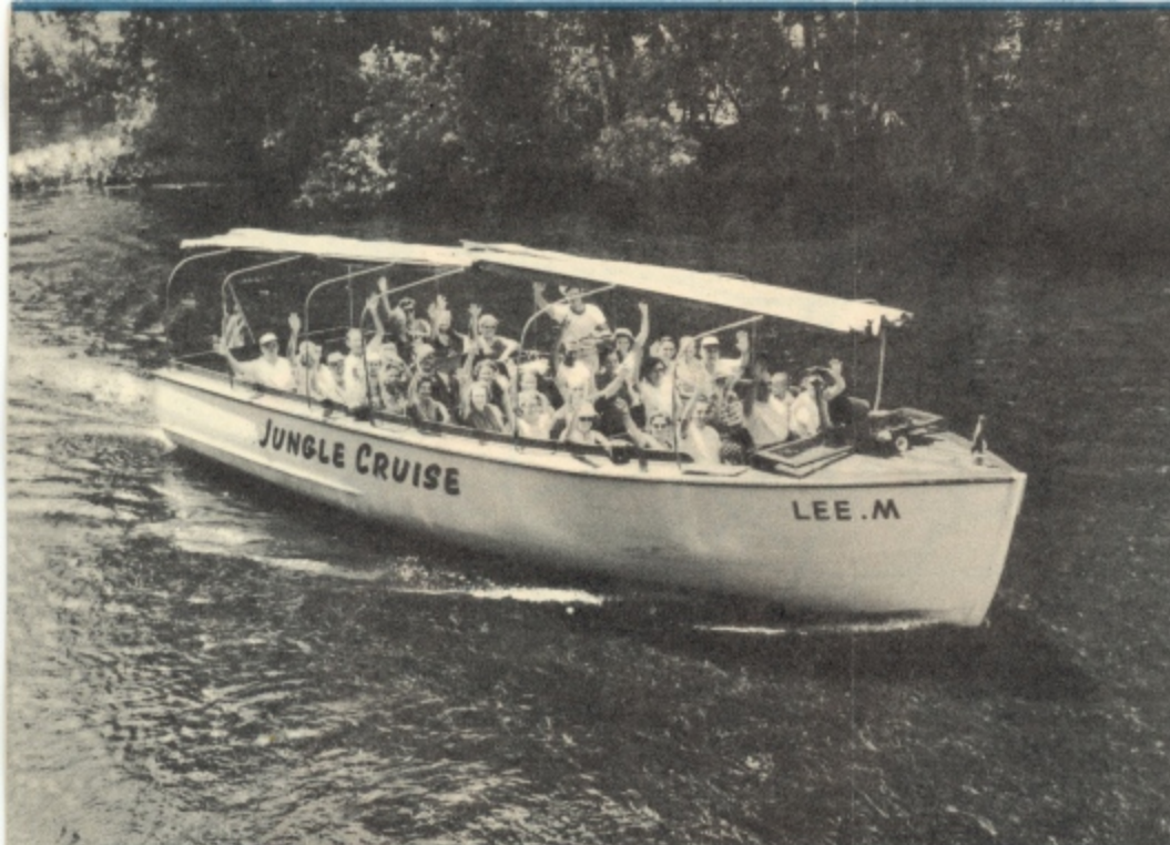
Jungle Cruising Down Tropical Silver River