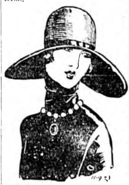
One of the new wide-brimmed hats—made of gold lame faced with brown velvet. A band of velvet with rhinestones at front is the sole adornment. It was chosen to wear with a brown velvet frock.

Among the large hats of the season Lewis of Paris has been making some known as Rembrandt shapes. They are decidedly picturesque, and trimmed only with a scarf to match wound around the crown. Often these Lewis hats are faced with richly embellished material.