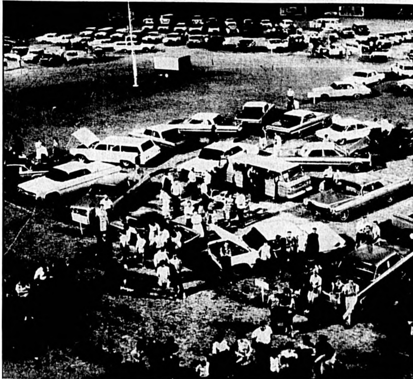
High above the Auto Show at Municipal Stadium, Wednesday night.