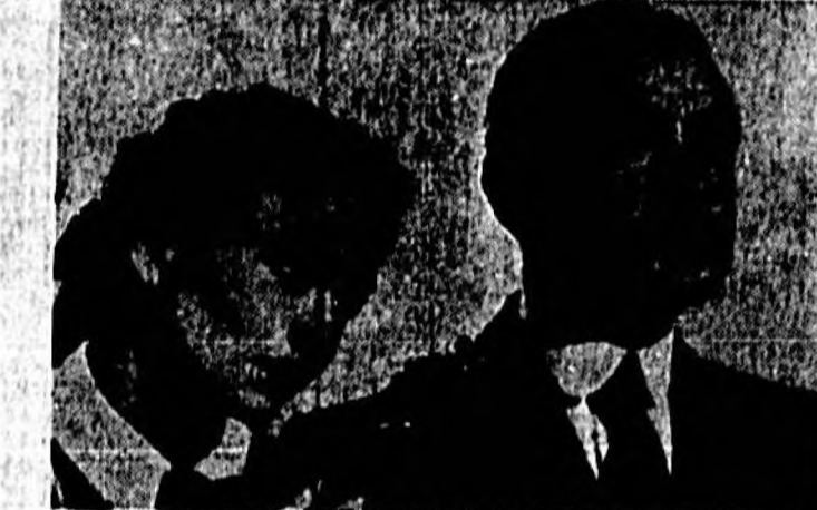
Jeanne Grain asks a favor of Clifton Webb in 20th Century-Fox's "Cheaper By The Dozen," in color by Technicolor, showing Sunday, Monday and Tuesday at the Ritz Theater.