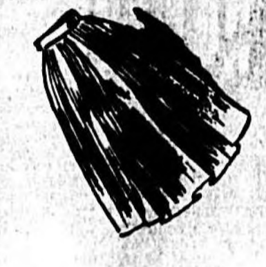
80 sq. Sanforized 6 yd. sweep circle skirts 2.98