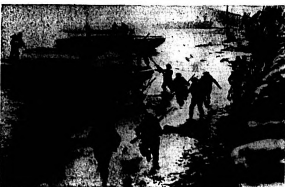
Support for the various hints that an invasion of the continent of Europe is in the offing indicated by these landing operations by British troops "somewhere in Scotland".