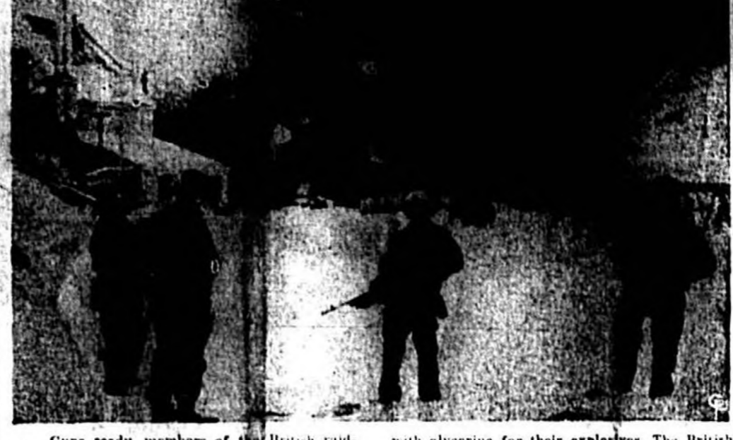
Guns ready, members of the British raiding party watch as fire sweeps the factory on the Lofoten islands, off Narvik, Norway...