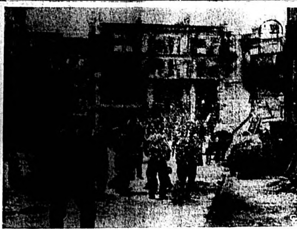
This picture, just received in the U. S. by clipper plane, bears out the observation that "England can take it." A group of Pioneers, whose job is clearing up ruins left by Nazi bombers, spend their lunch hour playing soccer in the shadow of bomb-blasted buildings. The workers at left appear more interested in the game than in the German-rough havoc.

GAINESVILLE, Mar. 20—(Special)—Final draft of the Florida Probation Association's bill to create a State Probation and Parole Commission as voted in the general election last November was completed at a meeting held at the University of Florida this week.