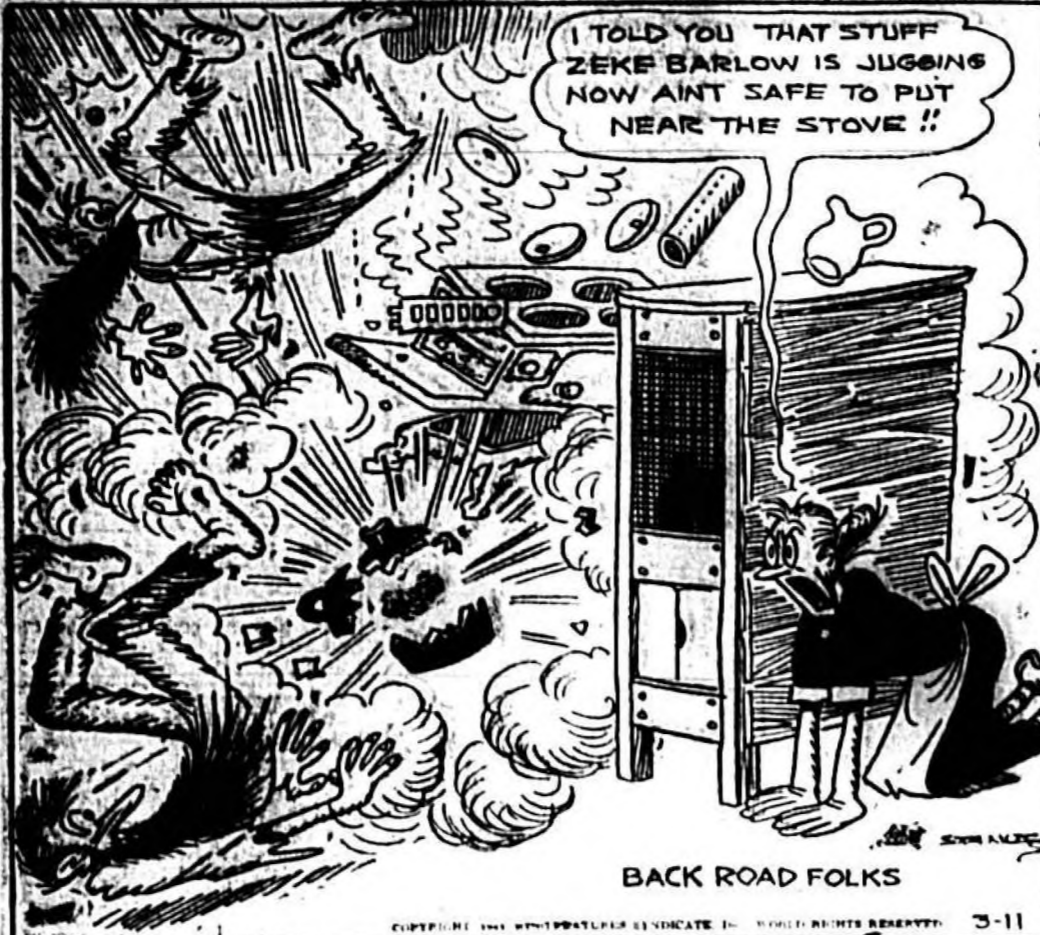
BACK ROAD FOLKS

which was sent yesterday to members of Congress, the institute held that "if and when additional payments are contemplated the welfare of cotton is best served by providing for them from the General Treasury rather than obtaining them through a marketing certificate plan, a processing tax, or a high loan rate.