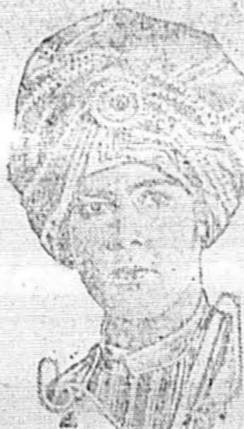
Rodolph Valentino in the Paramount Picture 'The Young Rajah'