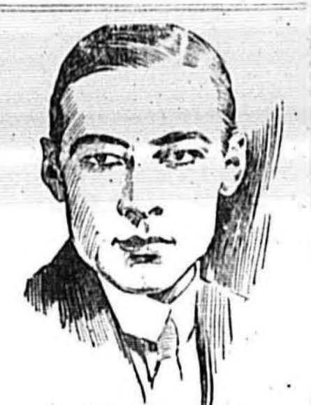
Rodolph Valentino The Gaiety Picture "The Young Rajah" At the Princess—on days—Friday and Saturday, Jan. 19th and 20th