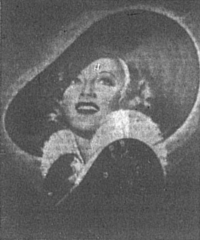
That's what the newspaper artist called Marion Davies when he sketched her in her role of "Dawn Glory" in "Page Miss Glory," her first Cosmopolitan production for Warner Bros. at the Milano Theater tonight.