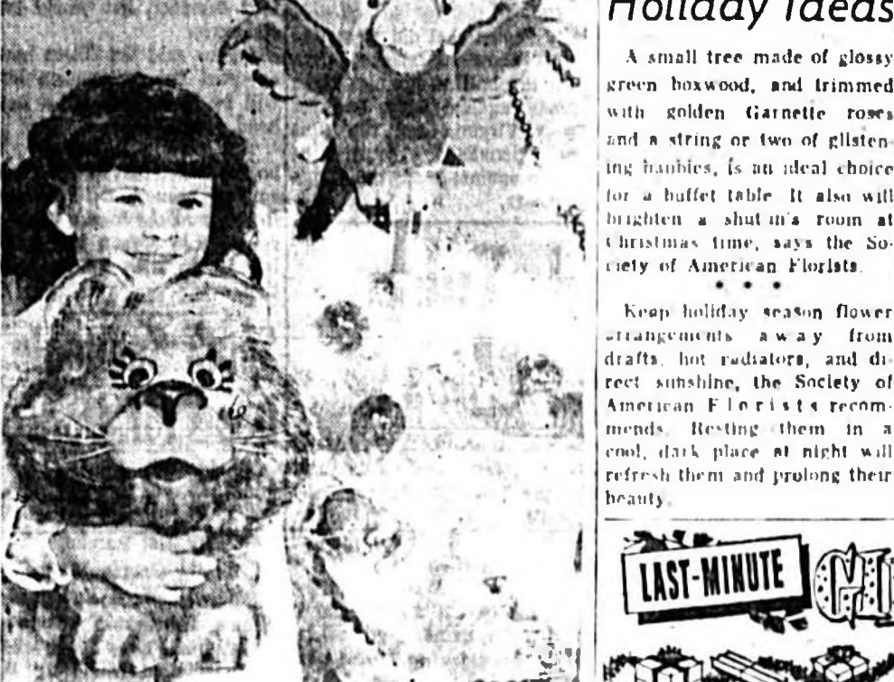
WHAT YOUNGSTER wouldn't be enchanted to find her Christmas tree decorated with cuddly talking Animal Yackers? Larry, the talking lion and Cracker, the talking parrot, actually seem to be chatting Larry's mouth and Cracker's beak move as they speak. Each says 11 different phrases at random with just a pull of the Chatty-Ring.

Wondering what to do with those bulky or oddly shaped gifts that seem to defy wrapping paper, ribbon or tape? Here's a wonderful new idea for wrapping with a covering that serves as a second gift in itself.