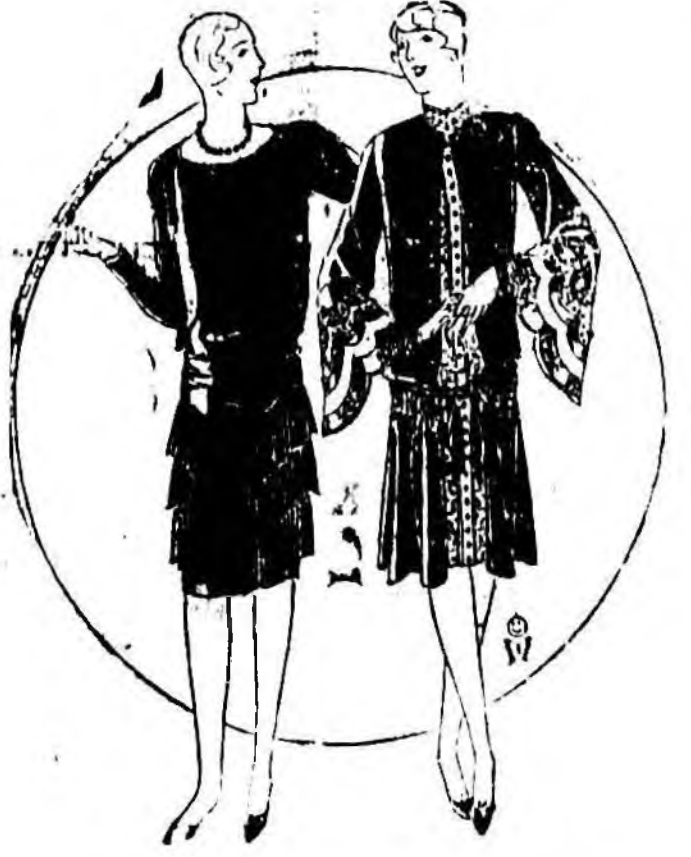
Blouse Backs, Plaited Skirts Side Drapes Are Now In These

COLCLOUGH REALTY COMPANY 311 First National Bank Bldg. Telephone 732 SANFORD, FLORIDA Real Estate Insurance