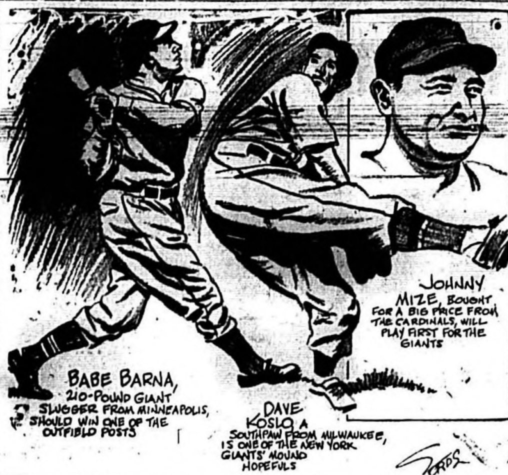
JOHNNY MIZE, BOUGHT FOR A BIG PRICE FROM THE CARDINALS, WILL PLAY FIRST FOR THE GIANTS.

ARSENAL FIRE HUNTSVILLE, Ala., Apr. 22 (AP)—One person was killed and two others were injured yesterday in a fire at the Army's chemical warfare arsenal here.