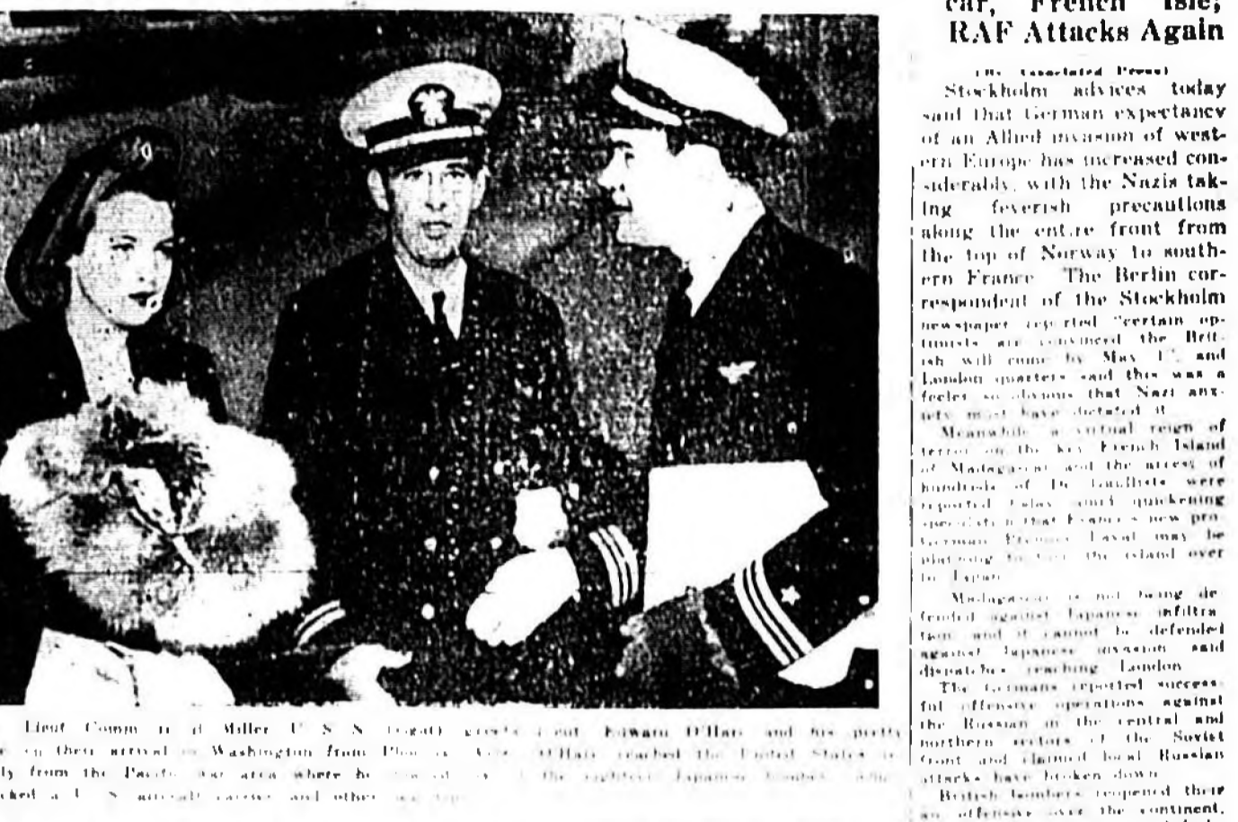
Capital Grooms Number One Air Hero