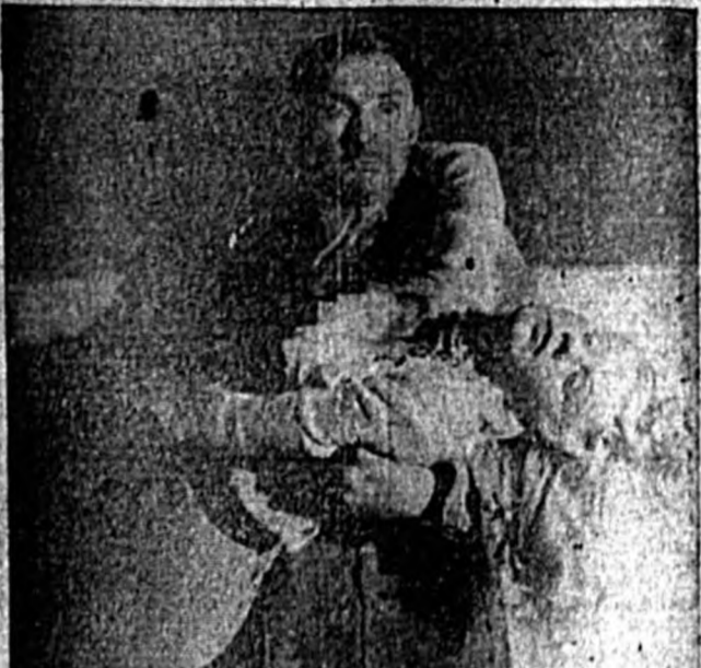
ALBERT DEKKER plays a homicidal maniac in Paramount's murder thrill film, "Among the Living," showing Tuesday only at the Ritz Theater. Here he is with one of his victims, blonde Jean Phillips. Others in the cast of this shoddy drama are Susan Hayward, Harry Carey, Frances Farmer, Gordon Jones and Maude Eburne. Dekker has a dual role, that of Paul, the madman, and of John Raden, the maniac's sane twin brother.