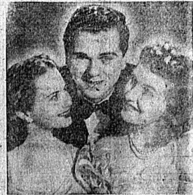
GLAMOUR TO THE RIGHT of him and glamour to the left of him, Jackie Cooper makes quite a hit in Paramount's lively comedy, "Glamour to the Right," coming next Friday and Saturday at the Ritz Theater. The glamour girls in the picture, above are Ann Gillis and Jackie's co-star, golden-voiced Susanna Foster.