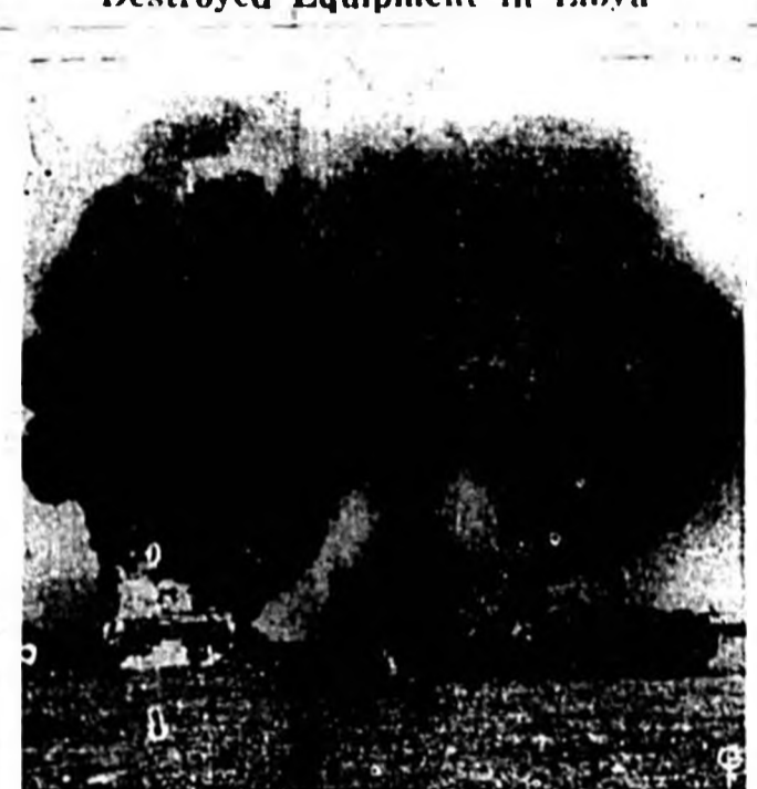
Axis tanks and supply trucks are pictured ablaze following the strong British offensive in Cyrenaica. South African troops helped blow up these German and Italian armored vehicles and supply trucks. The mopping up of Axis forces behind the lines is still going on according to the latest reports. This photo was passed by the British censor.