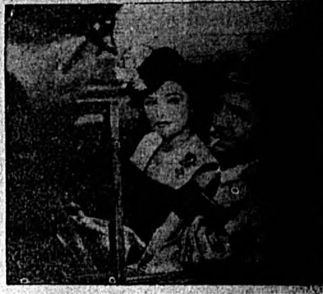
WILLIAM POWELL doesn't seem so happy when arrested by an officer and forced to show his driver's license in "Shadow of the Thin Man," which will be shown here tomorrow and Monday at the Ritz Theater. Myrna Loy, as usual, plays the part of his interfering, anxious-to-help wife.