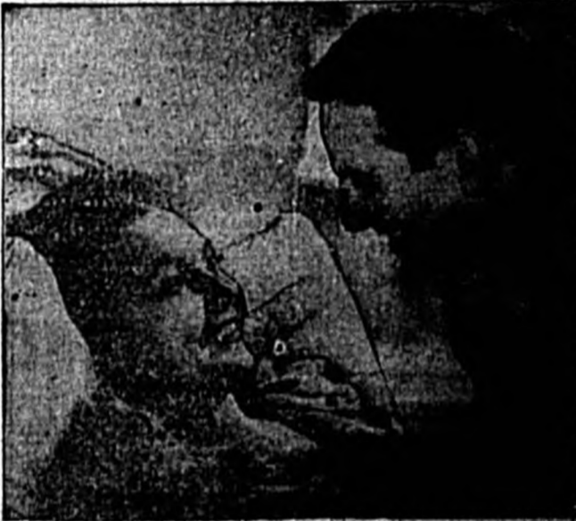
LYNN BARI, the frustrated wife, and John Sutton, the just too-perfect husband, try to iron out their affairs in "Moon Over Her Shoulder," which will be shown as part of a double bill at the Ritz next Tuesday.