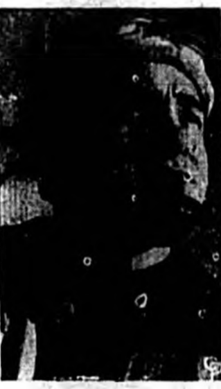
Ready for trouble, with an air of hard-bitten efficiency, this pilot of an interceptor plane keeps his eyes alert, somewhere on the east coast, for the possibility of a surprise attack on the alert day and night to repel any attempted invasion of the heavily industrialized Atlantic seaboard.