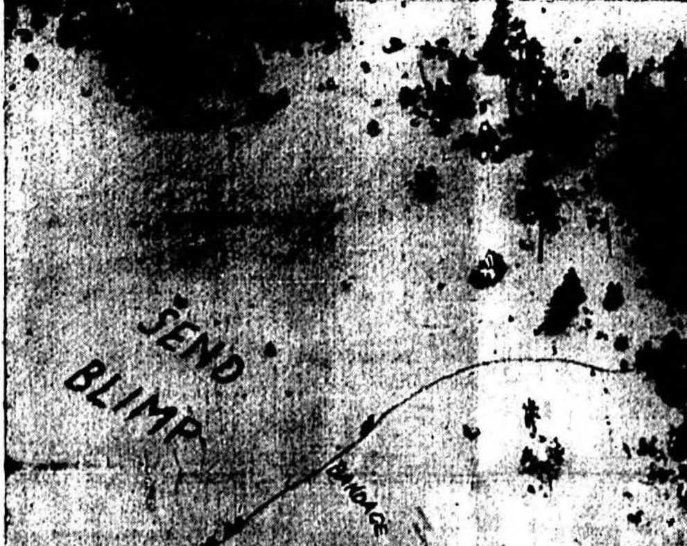
WHILE HUNTING FOR VICTIMS of a plane crash in Alaska, Coast Guard researchers stamped out snow messages to communicate with aircraft.