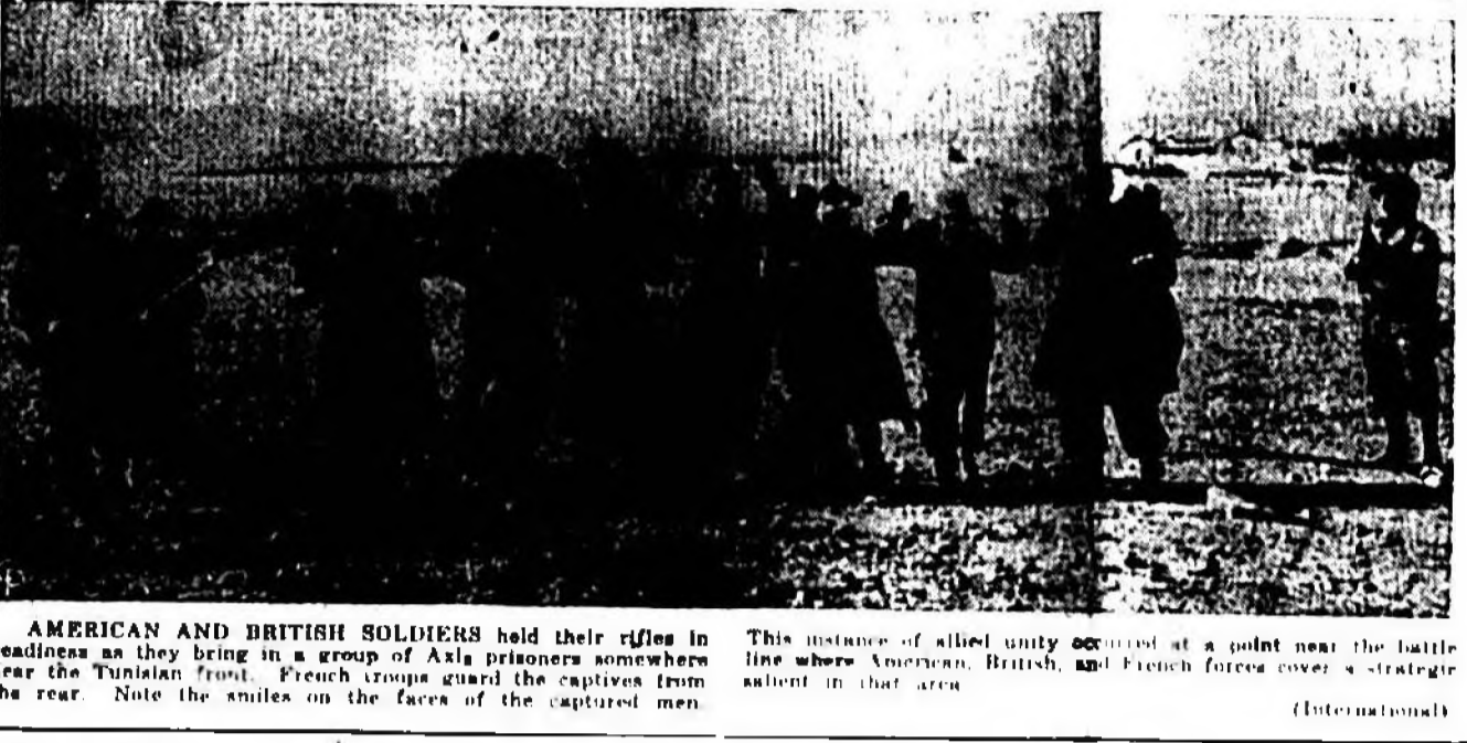
AMERICAN AND BRITISH SOLDIERS held their rifles in readiness as they bring in a group of Axis prisoners somewhere near the Tunisian front. French troops seized the prisoners from the rear. Note the smiles on the faces of the captured men.