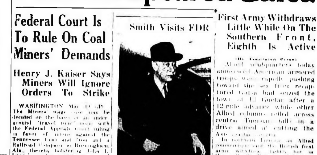
Smith Visits FDR

WASHINGTON, Mar. 18.—The U. S. Army today announced that it had recaptured the town of Gafsa in Tunisia.