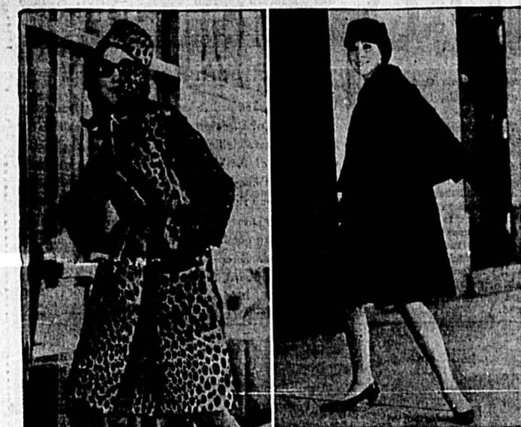
SPORTY STYLES IN HANDSOME FURS make their appearance for fall and winter. True trench coat with self-belt (left) is of cheetah and called "James Bond" Sherlock Holmes coat (right) is of stencilled lapin, red on black or green on black. Cape is removable and may be worn separately. These designs are by Donald Brooks for Coopchik-Forest.