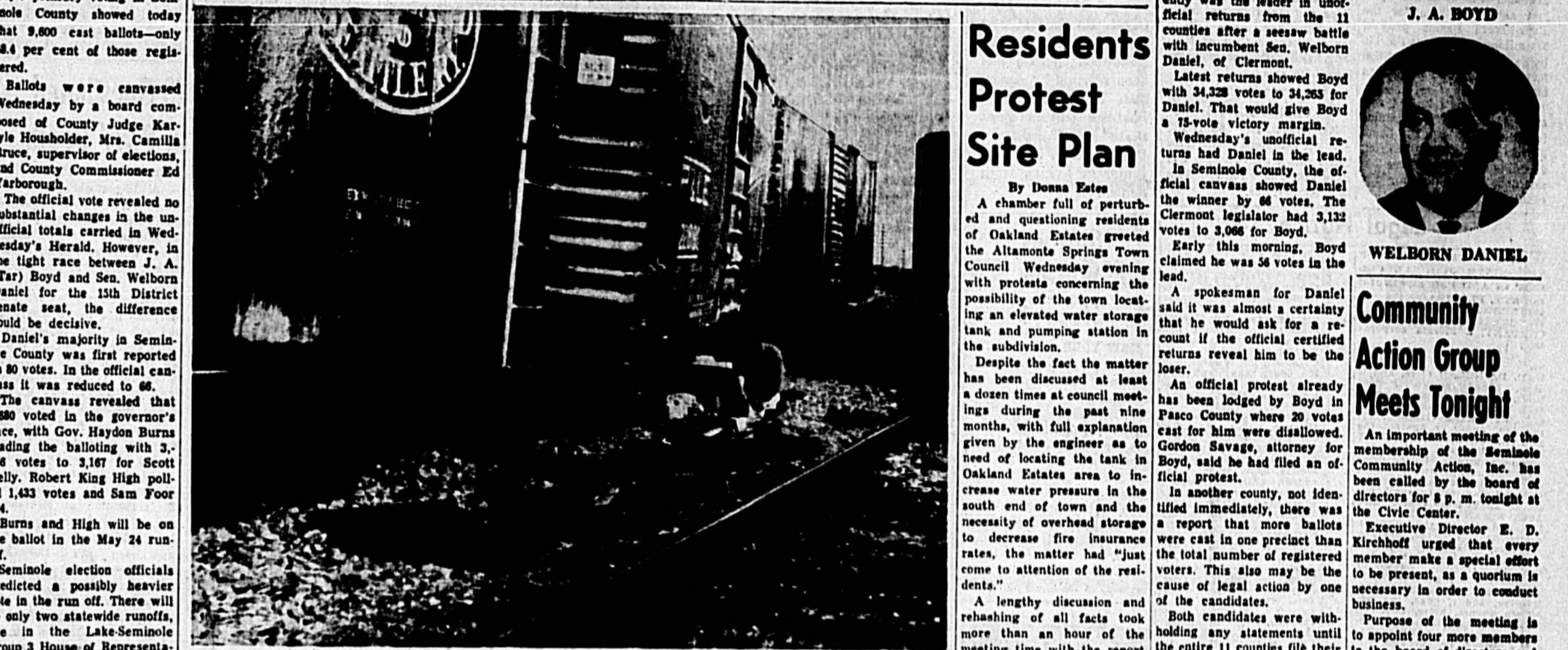
TWO CARS OF ATLANTIC COAST LINE freight train derailed early this morning on 80-000 train, guillotined into Sanford-ACL yard. There were no injuries or damage reported. Cause of derailment is undetermined. Train had originated in Tampa and Sanford was destination. Two boxcars that left track were 12th and 13th cars from rear of train. Local officials reported accident occurred about 6:30 a. m.

Canvass Shows No Change Seminole County 48.4% on the St. Johns River "The Nile of America" WEATHER: 84-67; low tonight 65-70; high Friday about 85. VOL. 88 NO. 184 - UPI Leased Wire - Established 1908 - THURSDAY, MAY 8, 1966 - SANFORD, FLORIDA - Price 5 cents