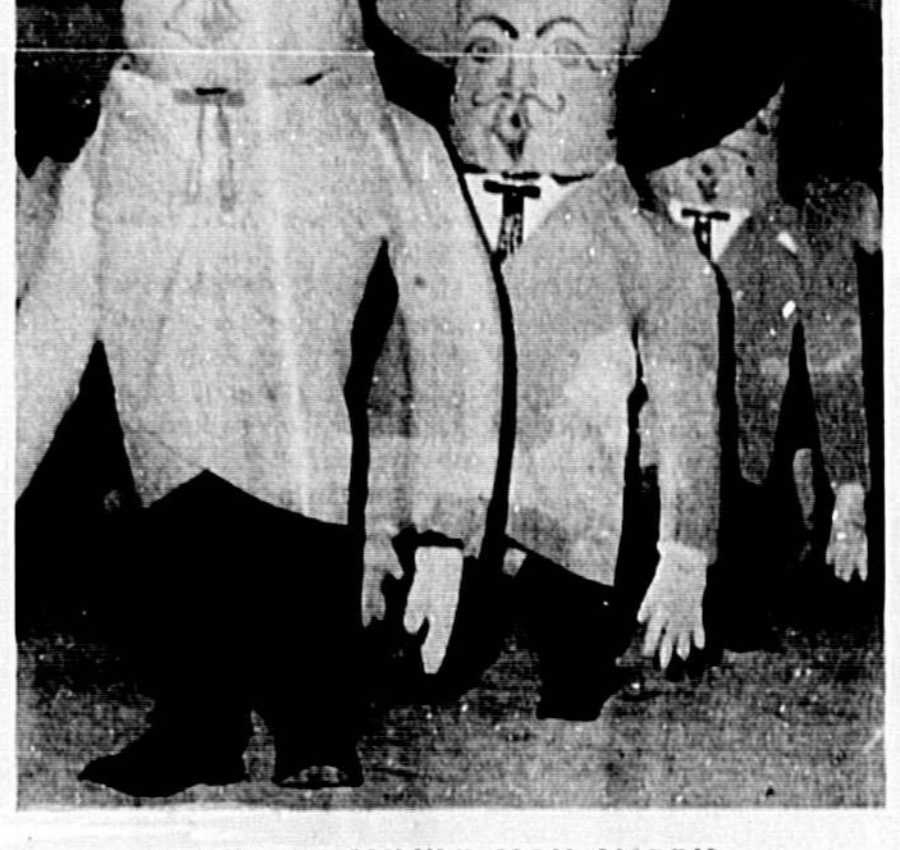
WHISTLE WHILE YOU WORK TOP entertainment is provided in these parts by the Marching Moselems. Audiences are in for a hilarious time when they are part of the program, as they were last Monday as a filly for the Labor Day Regatta beauty pageant. (EYL, their "mouths" in this photo really are their belly buttons.)