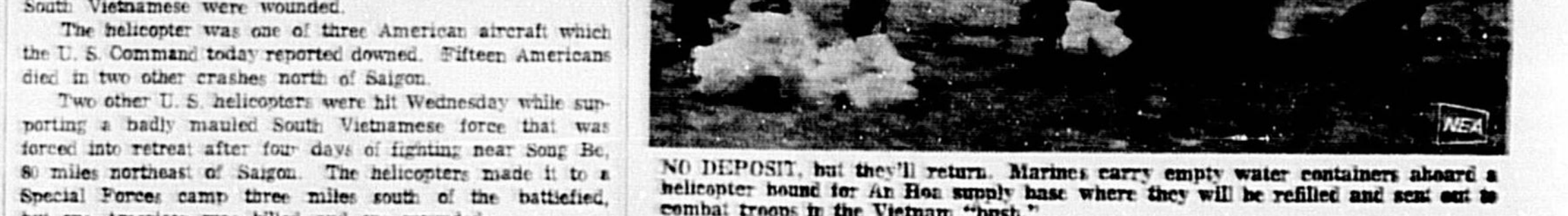
NO DEPOSIT, but they'll return. Marines carry empty water containers aboard a helicopter bound for An Hoa supply base where they will be refilled and sent out in combat troops in the Vietnam "Duck."

SAIGON (AP) — U.S. and South Vietnamese troops clashed with "enemy" soldiers inside Cambodia after an American helicopter was shot down Monday and crashed a mile across the border.