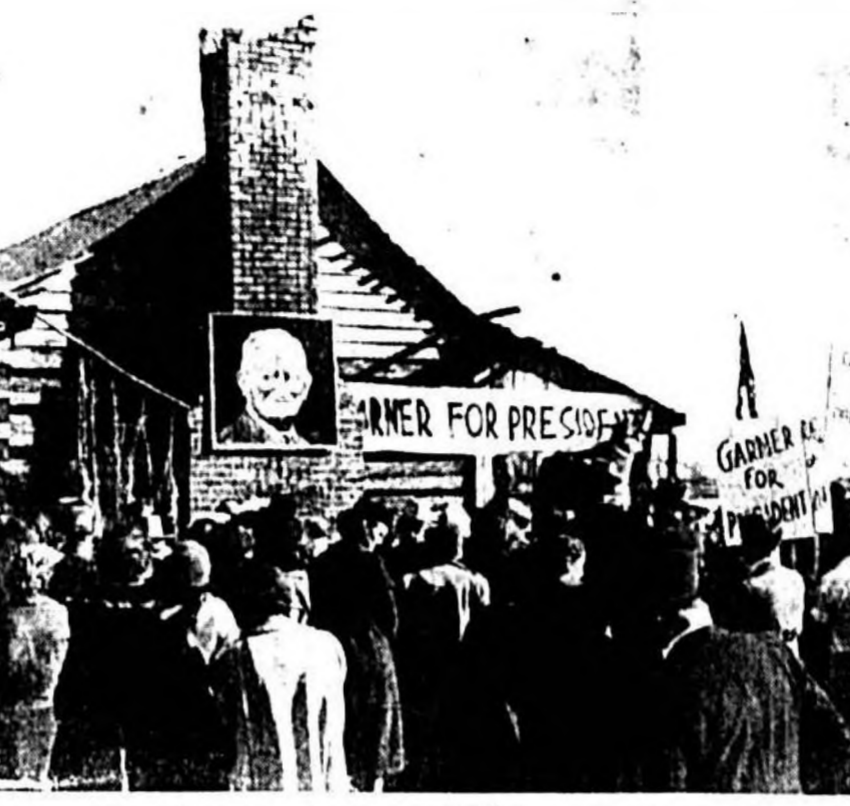
Following a "Garner for President" meeting in 1937, friends of the Senator met at the North Florida Hotel to discuss the party.