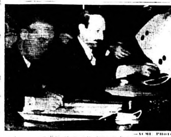
Members of the Educational Society, Sanford Education Committee, and other members of the community signed the anti-war pact at a meeting held in the city hall.