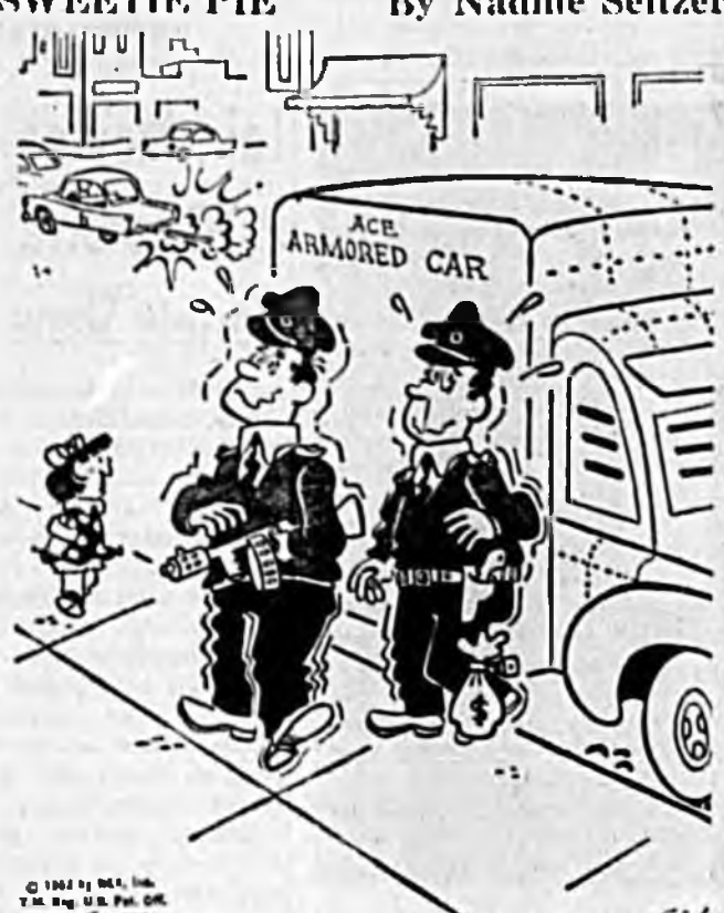
"Some backfire, wasn't it?"