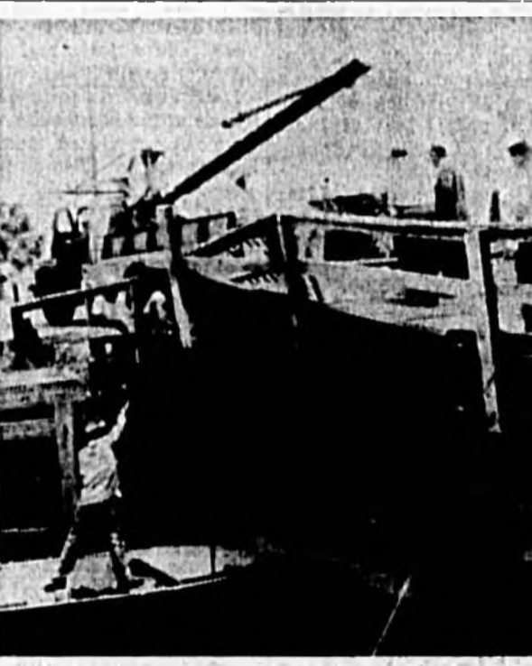
Scene Of The Repair Job

Ambulances were sent to the scene but the number of casualties, if any, was not immediately determined. The Air Force said the explosion occurred shortly after 7 a.m. Witnesses reported seeing a cloud of white smoke rise from one of the silos. Air Force security personnel rushed to the scene.