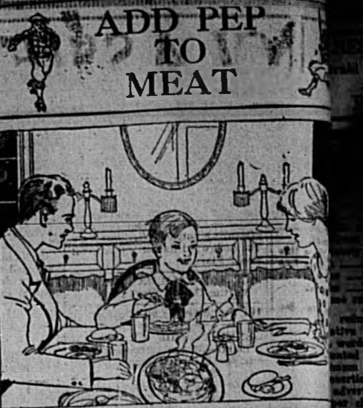
ADD PEP TO MEAT

Women are working in New Orleans. The article highlights the contributions of women in the workforce during this time.