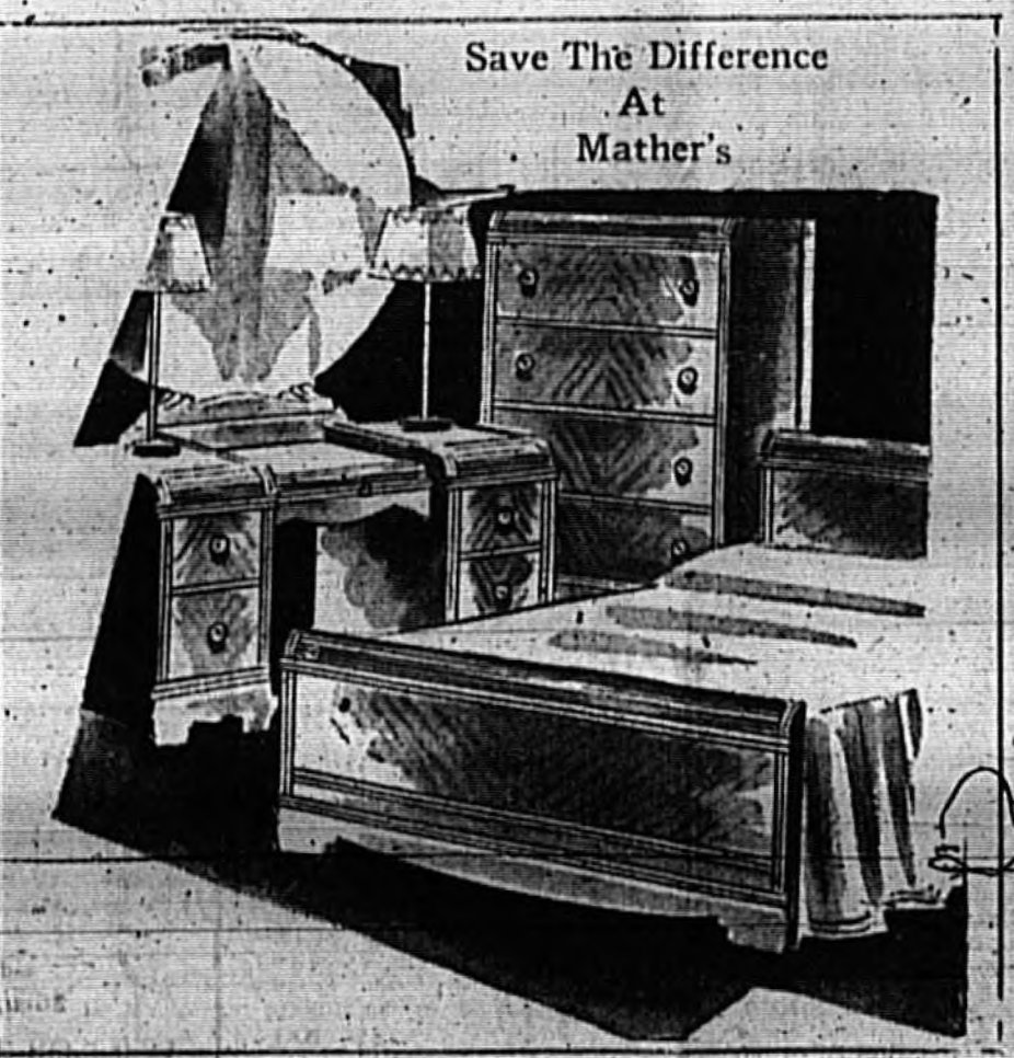
Save The Difference At Mather's