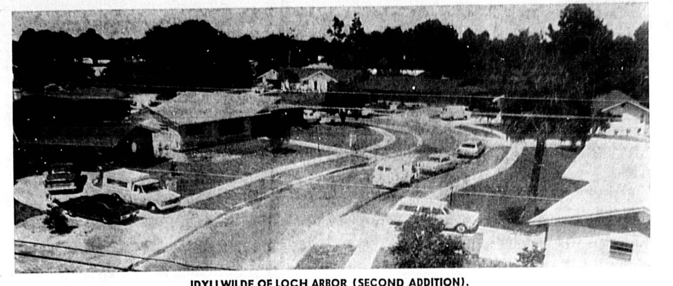
IDYLLWILDE OF LOCH ARBOR (SECOND ADDITION).

(Today's Herald carries an eight-page section emphasizing the "Show of Homes" for the second addition of Lych Arbor. Be sure to peruse this special section of The Herald today.)