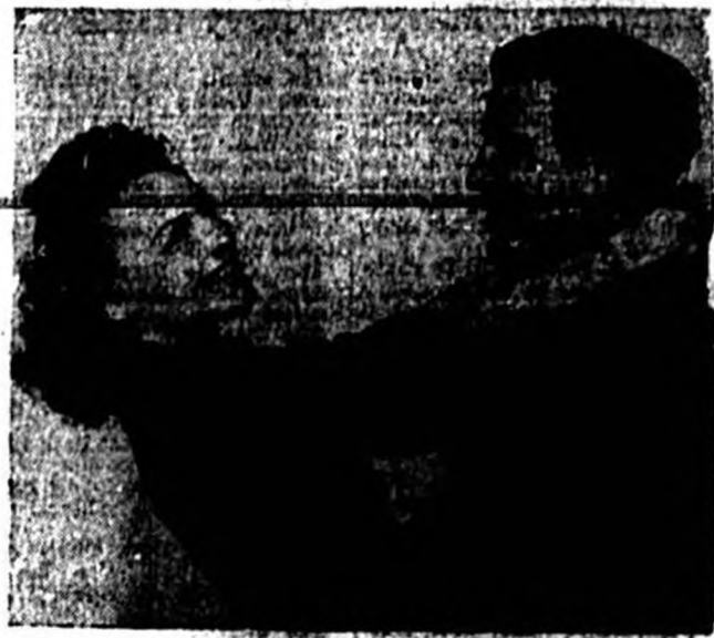
Elyse Knox and Don Terry find romance in their latest picture, "Top Sergeant", featured with Lee Carrillo and Andy Devine, at the Ritz Friday and Saturday.

Quality liquor that even the Navy can serve proudly. ARCADE Package Store ALL POPULAR BRANDS Mather Bldg. Phone 9148