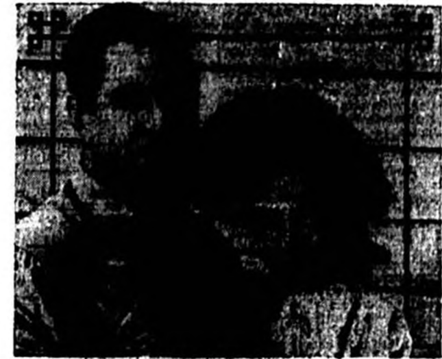
Bill Fargo (Johnny Mack Brown) and Linda (Jeanne Kelly) watch the mob intent on lynching Bill for a framed-up murder, in "Fighting Bill Fargo". Part of a fine double-bill program continuing to the Ritz, Friday and Saturday.

PINE GUM AUCTIONS LAJE CITY, Apr. 14, (FNS)—Pine Gum auctions at the State Farmers' Market here opened last Wednesday as the season. This method of handling pine