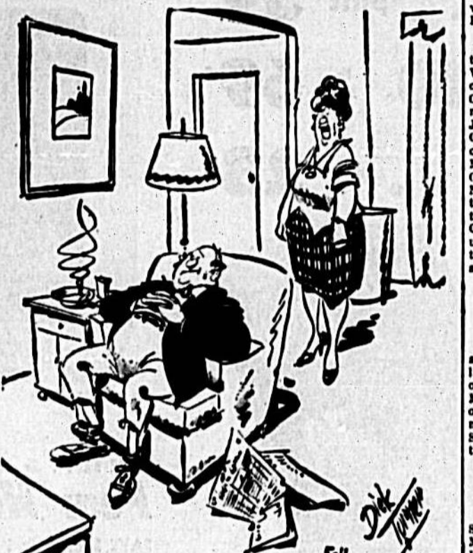
Illustration for 'CARNIVAL' by Dick Turner.