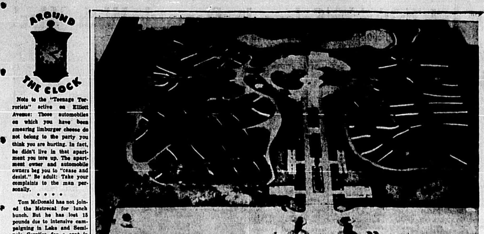
SCALE MODEL of the proposed new zoo and tropical garden, to be built on the city sanitary landfill area on Seminole Boulevard has been presented to the city by the Sanford Chamber of Commerce. In lower foreground is a parking area; on the sides are the open areas, while in the background are pools for aquatic animals, with a miniature train track twisting through and around them. In center is the concession area, fountains, playground area and other carrousel-type fun rides. In lower center are picnic areas. The model is expected to be put on display in a bank this week.

Seminole County * * * * on the St. Johns River * * * * "The Nile of America" The Sanford Herald Phone 322-3611 Zip Code 32771 WEATHER: Tuesday 83-64; Wednesday 65-70; Thursday 85. VOL. 88 NO. 188—UPI Leased Wire—Established 1904—TUESDAY, MAY 11, 1966 — SANFORD, FLORIDA — Price 5 cents