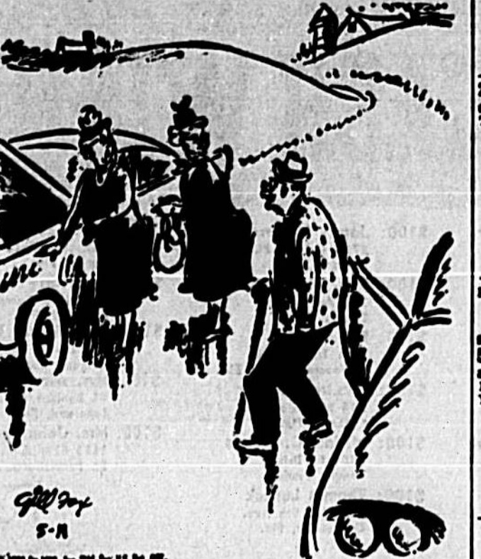
Illustration for 'SIDE GLANCES' by Galbraith.