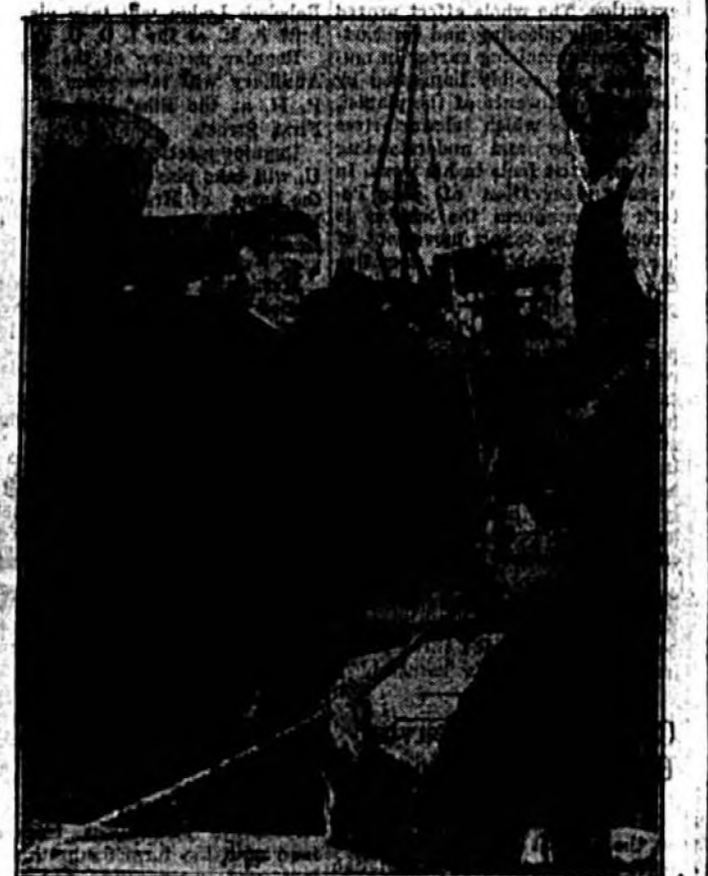
While more victims of the Morris Castle disaster were being taken from the wrecked vessel, United States attorney continued his investigation of possible criminal negligence.