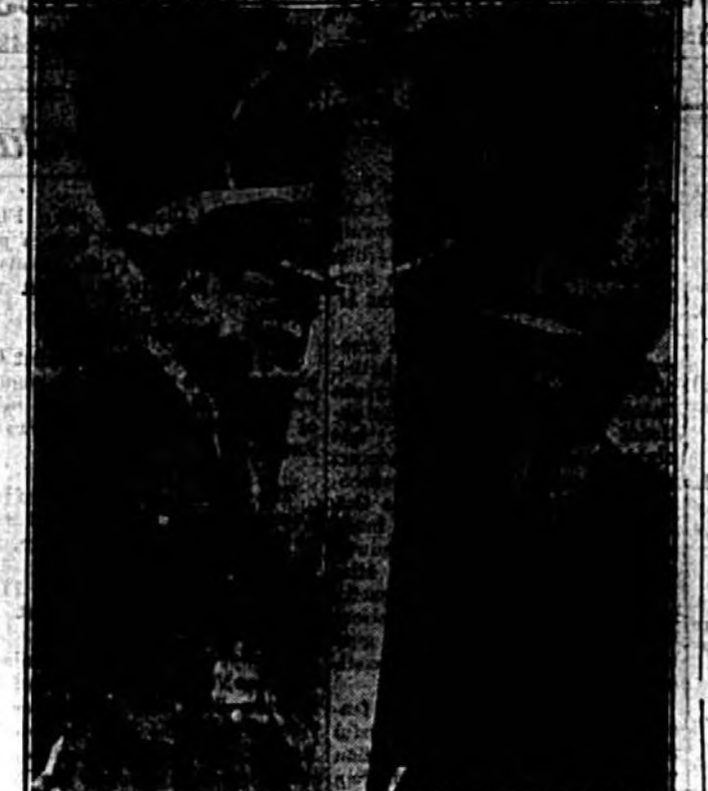
Turner (left) and Clyde Pangborn are shown before Melbourne race in October. They topped up the new ship in a flight from Seattle to Los Angeles and thence to New York.