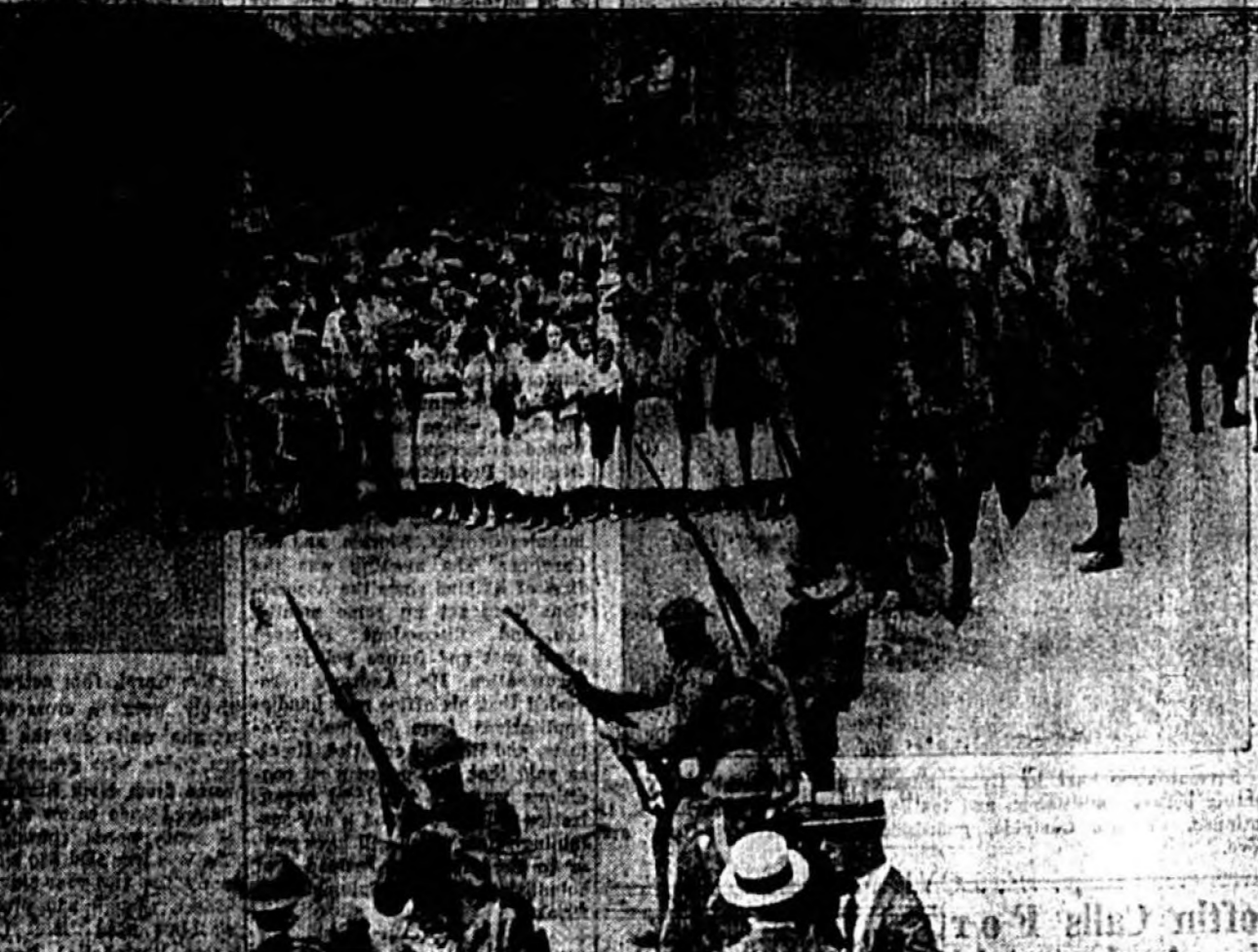
Men on hauling "flying squadrons" of textile strikers who sought to keep cotton mills from operating.