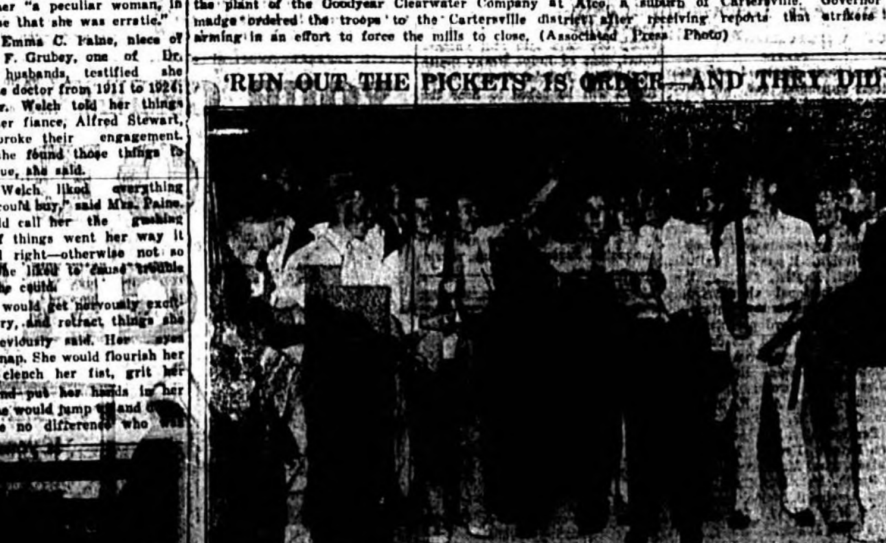
A flying squadron of textile strikers from nearby towns dispersed hurriedly at Ashton, Ga.