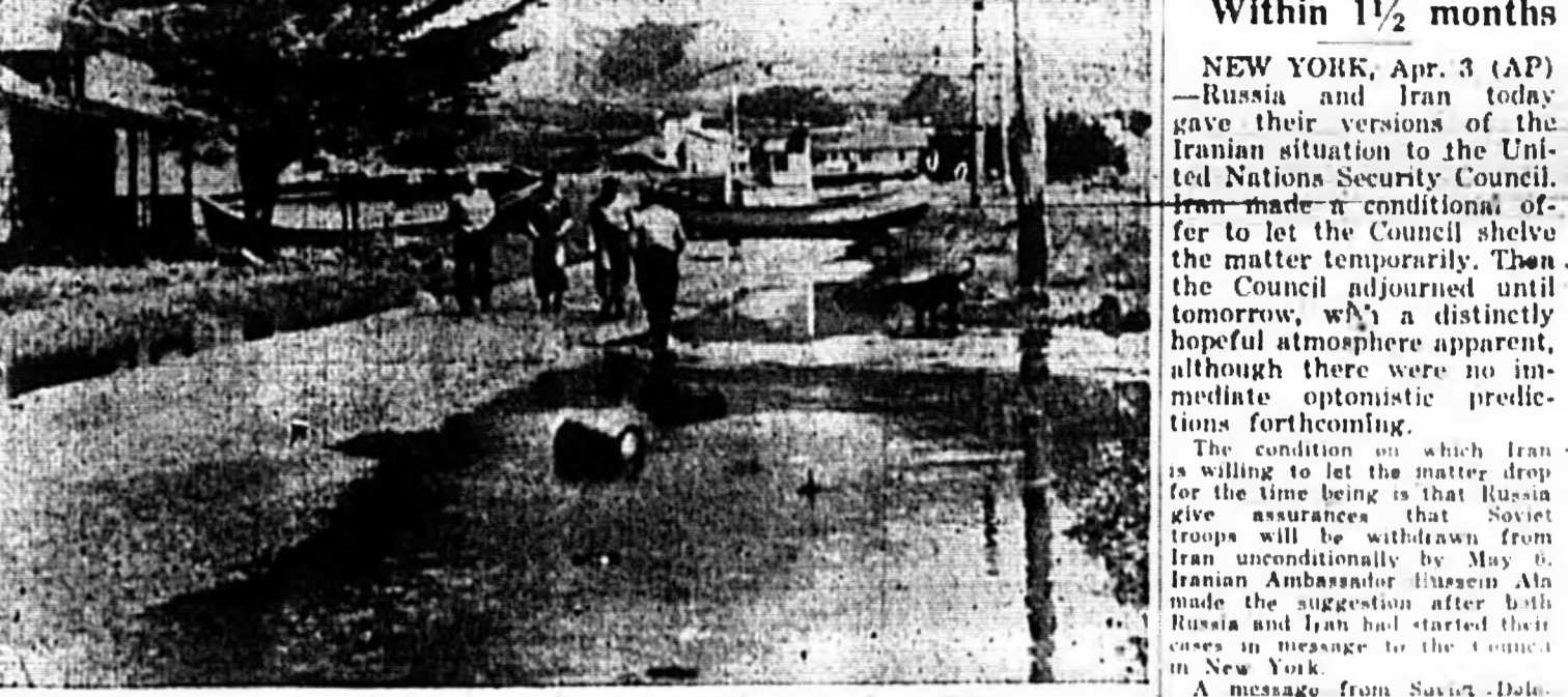
WASHED UP on the beach 100 yards and deposited across the road at Pointon-by-the-Sea, about 30 miles from San Francisco, these fishing craft show the power of the tidal wave that struck the coast after causing severe damage to property and lives in Hawaii. At least 25 persons in the Pacific Islands were killed, while 11 lost their lives along the California coast.