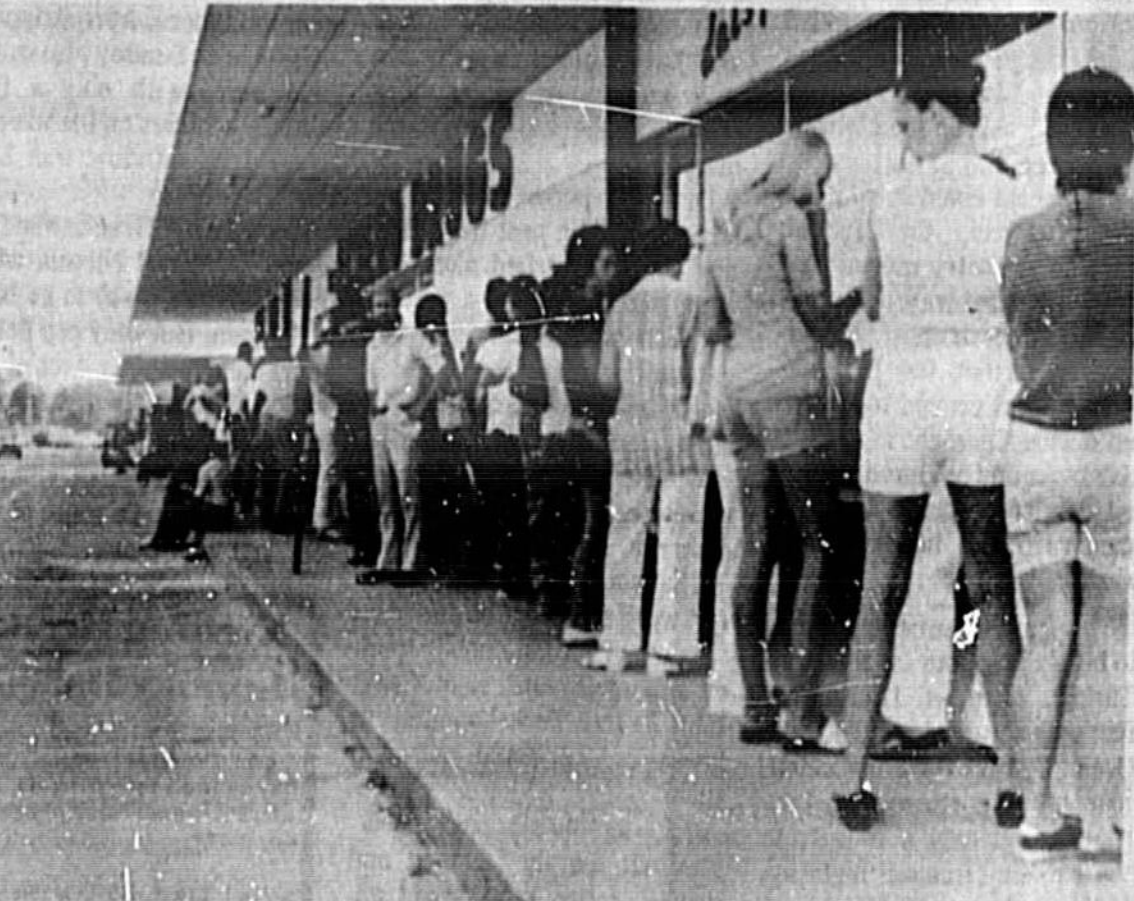
LONG WAIT TO BUY TAG This was the scene this morning at Seminole Plaza, Casselberry, as last minute tag buyers lined up around the shopping center waiting for the tax collector's office to open so that they could purchase '75 auto licenses before Tuesday deadline.