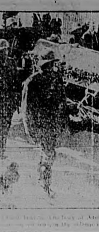
Foreigners are quitting a province in China as bandits lure them away. The province is being abandoned by the foreigners.