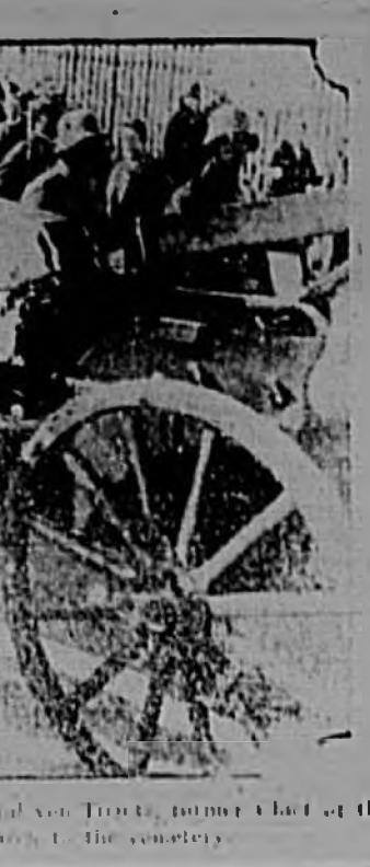
Foreigners are quitting a province in China as bandits lure them away. The province is being abandoned by the foreigners.