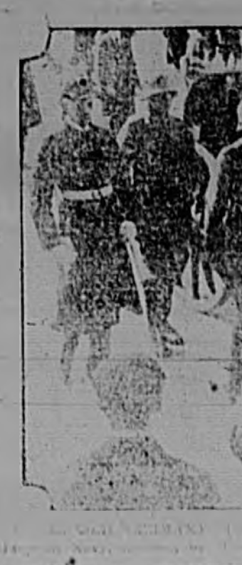
Foreigners are quitting a province in China as bandits lure them away. The province is being abandoned by the foreigners.