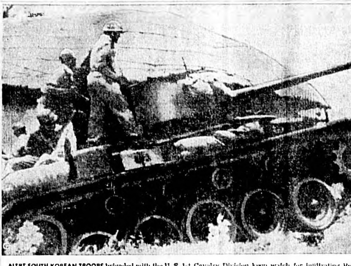
ALERT SOUTH KOREAN TROOPS brigaded with the U. S. 1st Cavalry Division keep watch for infiltrating Red snipers as an American tank lumbers through strategic Yongdong. Heifered North Korean Communist fighters for Yongdong on the rail line leading to Pusan in the face of repeated American tank defenses supported by artillery and Air Force sweeps over attackers.

South Korean Troops Ride U. S. Tank At Yongdong