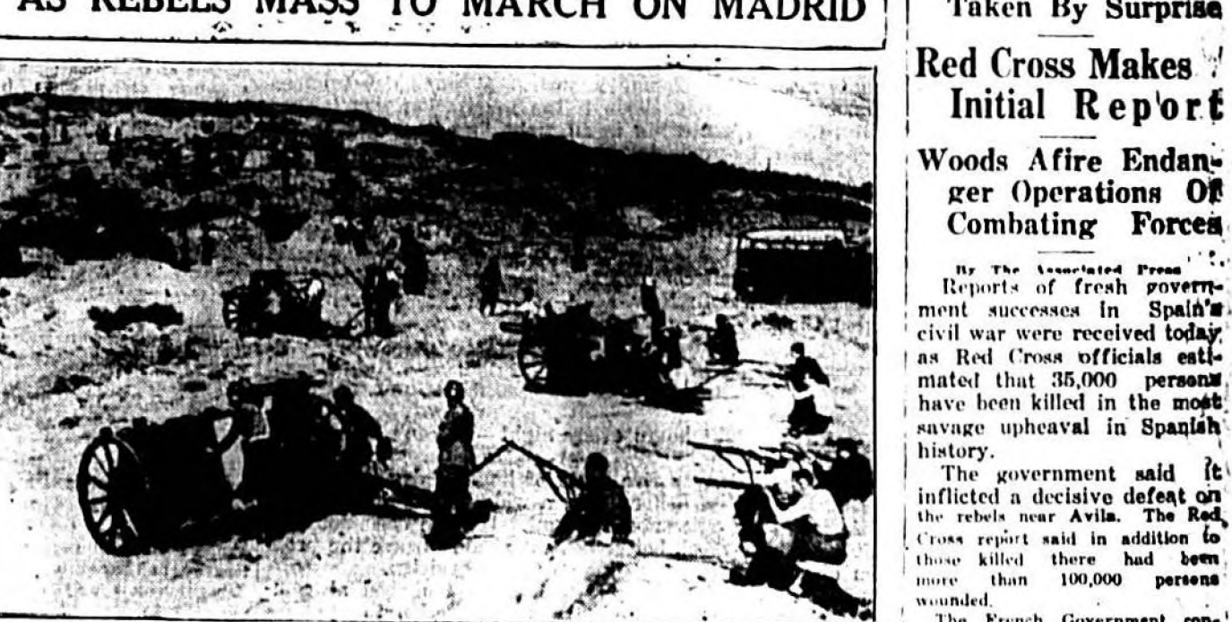
Heavy fighting broke out with renewed vigor when Spanish rebels massed their forces in the Guadarrama mountains for the march toward Madrid. Government military units are shown battling to stem the onrush in the hills 50 miles north of Madrid.