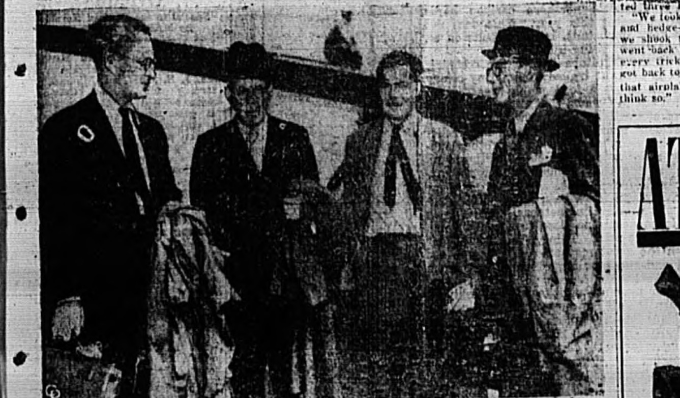
MEMBER OF THE BRITISH DELEGATION, sent to the United States to begin a study of ways to modify the terms of the U. S. loan to Britain, are pictured on their arrival at the National Airport in Washington. The member of the U. S. loan to Britain, are pictured on their arrival at the National Airport in Washington. The member of the U. S. loan to Britain, are pictured on their arrival at the National Airport in Washington.