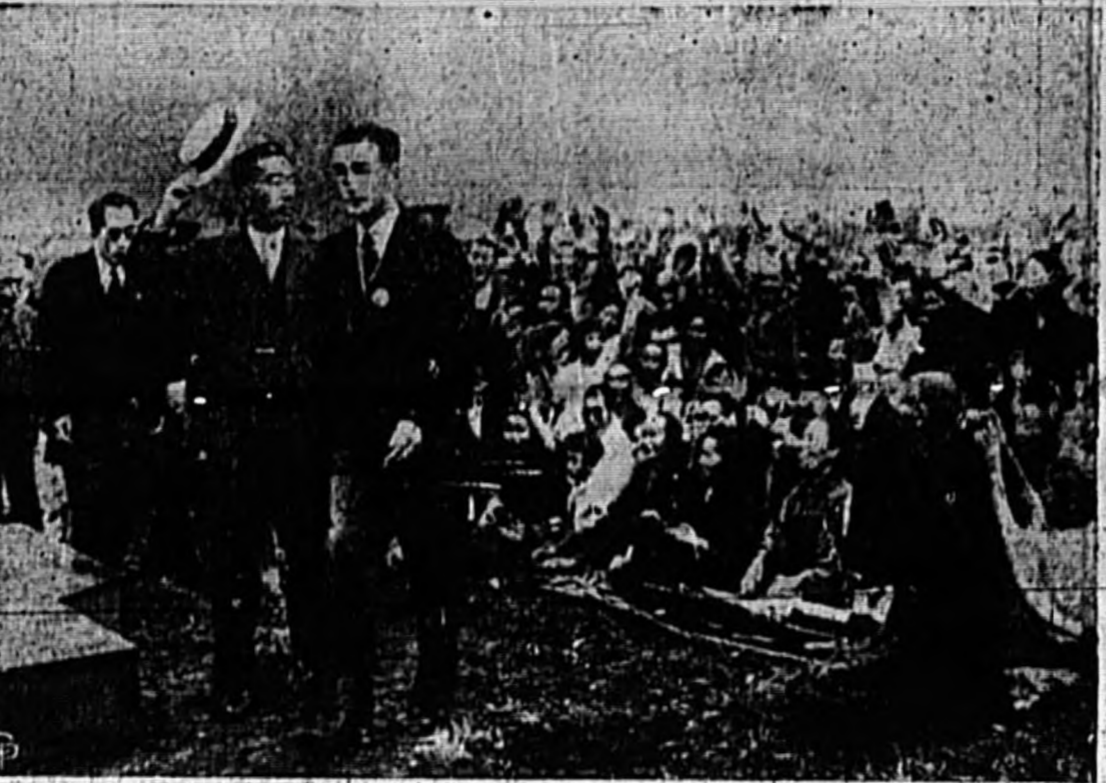
THIS PHOTO WAS FLOWN FROM TOKYO to the United States by Capt. William Odum on his record-breaking solo flight around the world. It shows Jap repatriates from Russian-held areas of former Nipponese conquests...