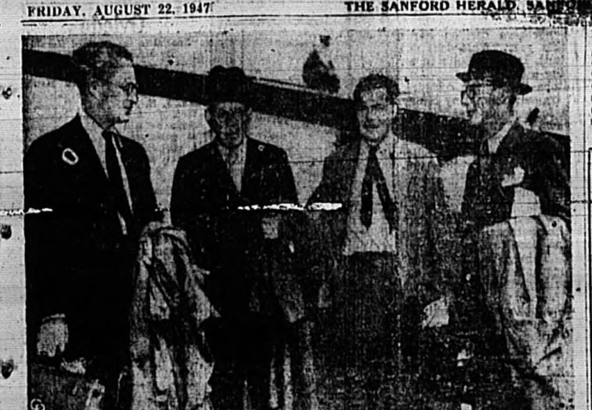
MEMBERS OF THE BRITISH DELEGATION