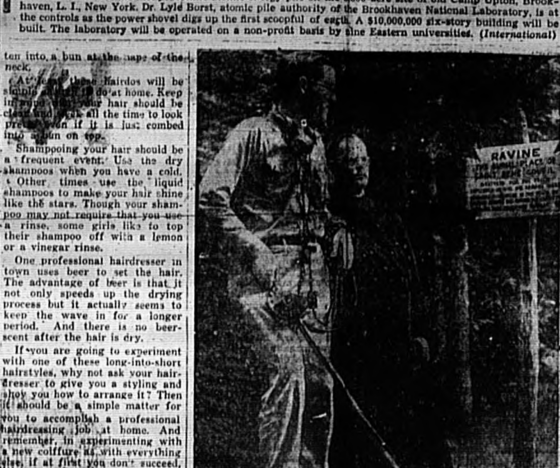
THE NATION'S ATOMIC OFFICIALS AND MAYORS OF 17 LONG ISLAND COMMUNITIES LOOK ON AS GRASS IS BROKEN FOR CONSTRUCTION OF THE FIRST POSITIVE ATOMIC ENERGY PILE ON THE 200-ACRE SITE OF OLD CAMP UPTON, BROOKLYN