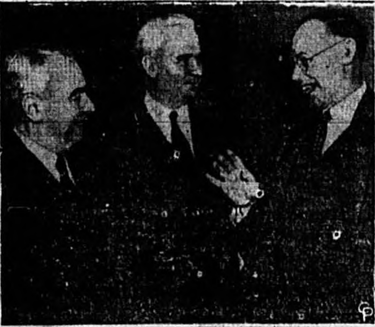
VETERAN LEADERS of the G.O.P. meet in Washington to elect officers and prepare to assume responsibility for the huge volume of legislation which will confront the 80th Congress.