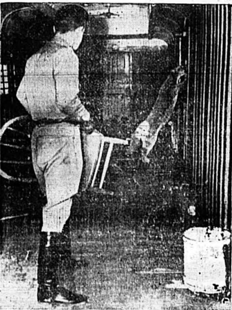
AN ANIMAL TRAINER teaches one of the three wild panthers which took out of their cages on a train en route to Los Angeles from the town in Dallas, Tex. Employees left the car naturally and unloading the line was snarled when the animals escaped