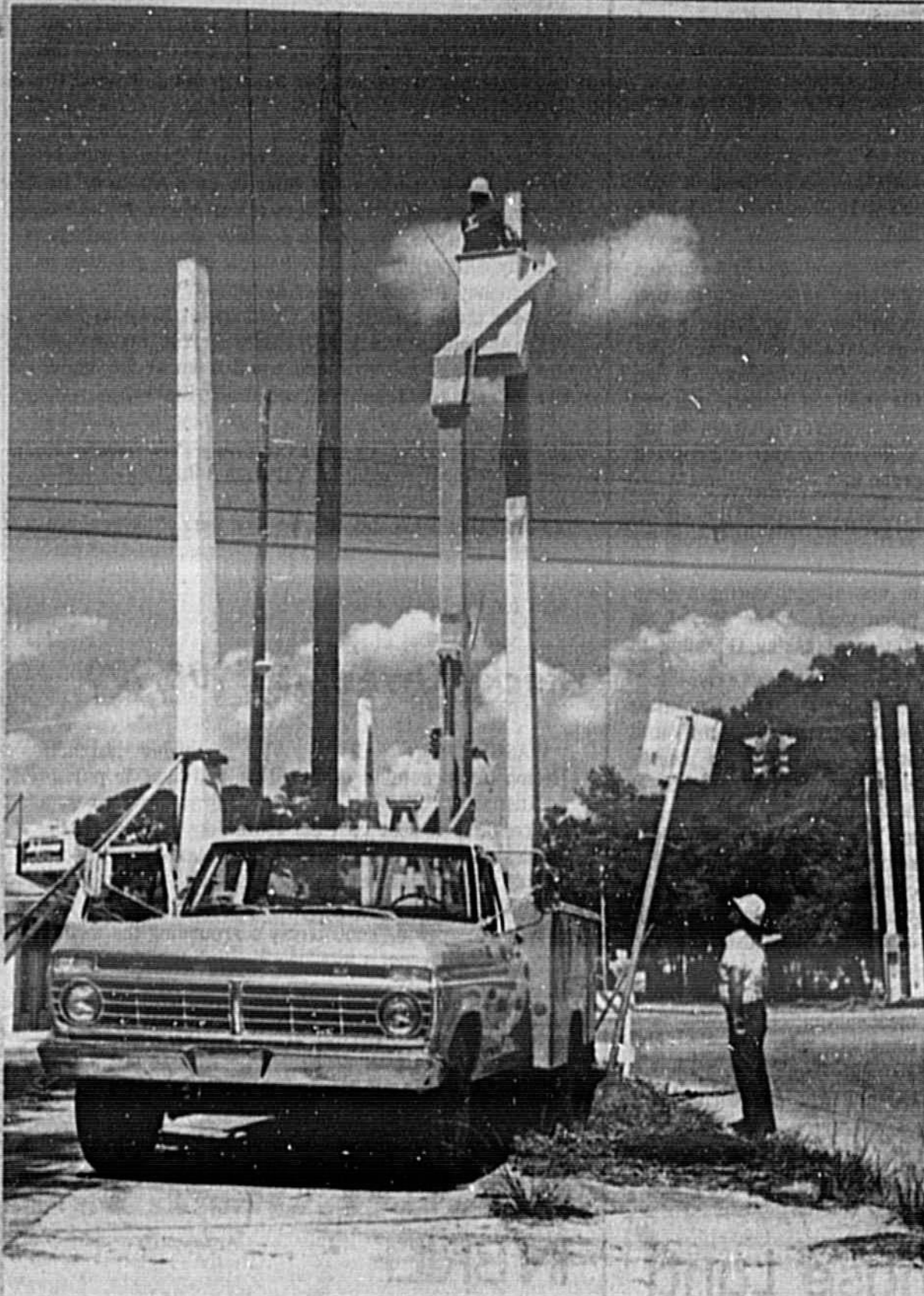
City of Sanford crew removes concrete utility pole at 25th Street and Sanford Avenue after state Department of Transportation installed new pole. Left, wooden traffic signal supports further from intersection. Moving pole in center was temporarily installed by city to facilitate modification work.

67th Year, No. 52—Sunday, October 20, 1974 Sanford, Florida 32771—Price 20 Cents