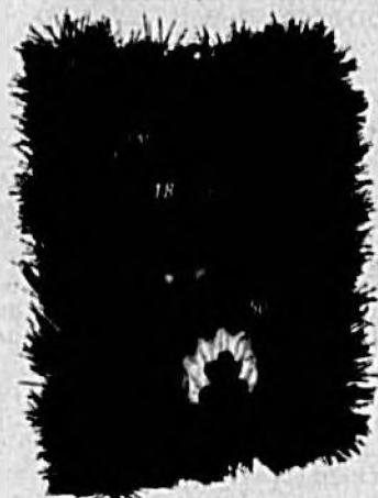
$13.97 18 ft.

Selection may vary. See stores for details.