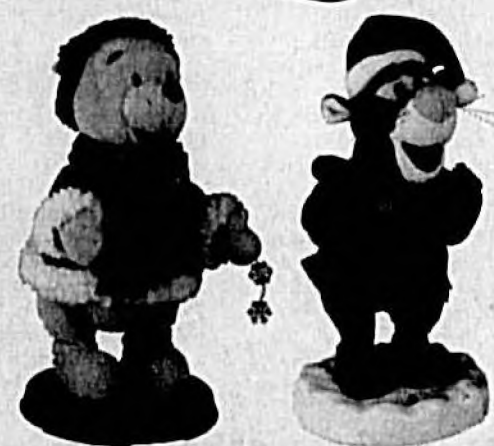
YOUR CHOICE $19.97 each

Selection may vary. See stores for details.