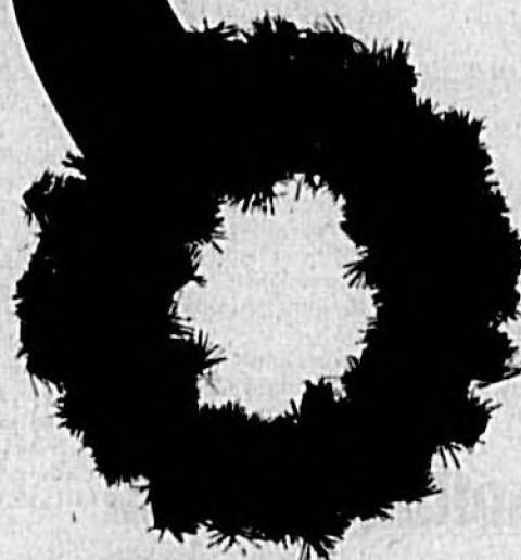
$4.97 20 in.

Selection may vary. See stores for details.