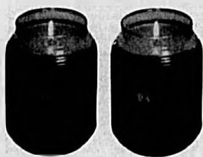
from $5.97 to $7.97