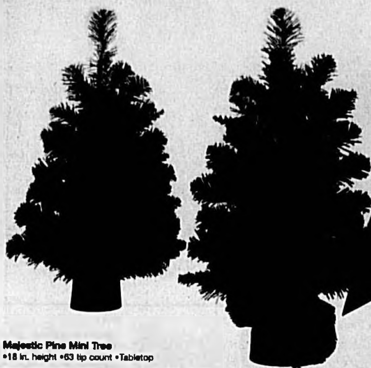
Majestic Pine Mini Tree •18 in. height •63 tip count •Tabletop Tree with Burlap Base #122797 $3.97 Tree with Round Plastic Stand #122747 $3.97