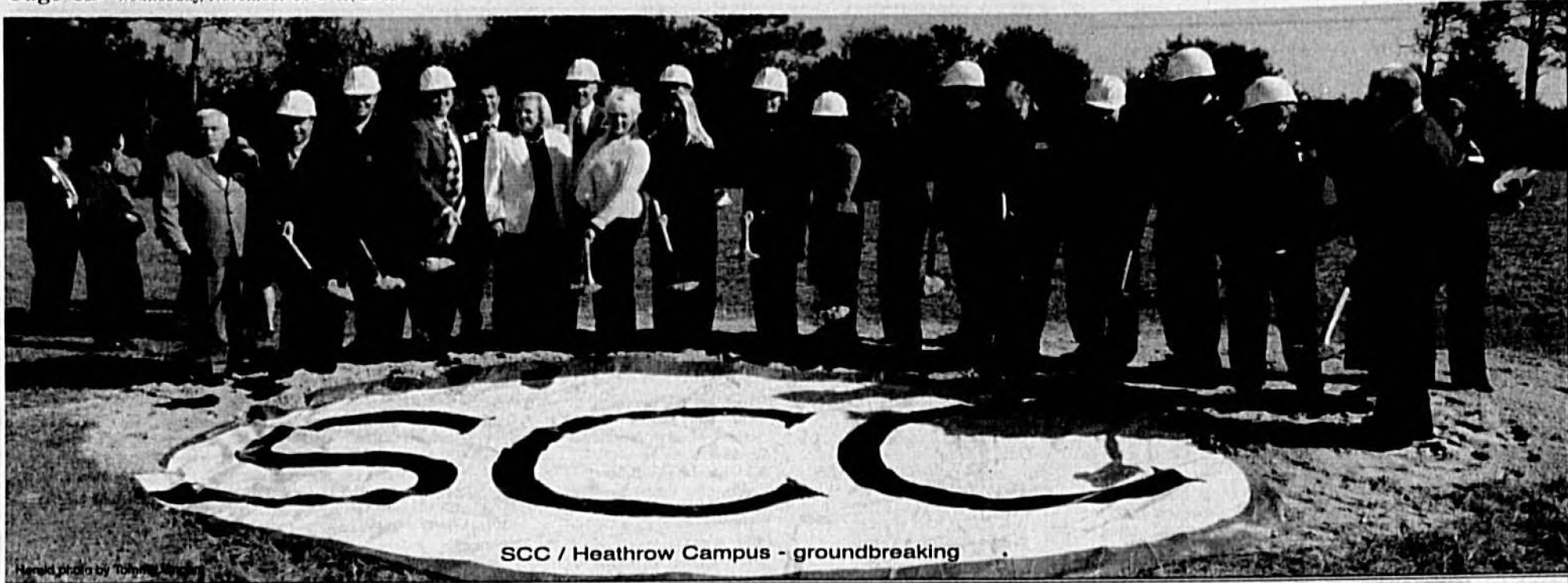
SCC / Heathrow Campus - groundbreaking