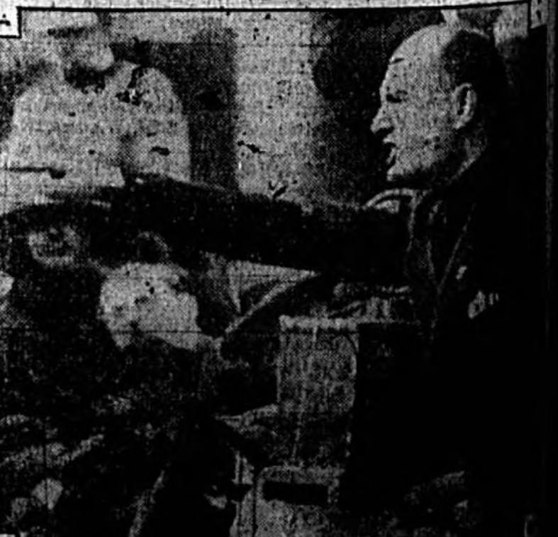
This photo of Premier Mussolini, which was taken at a public gathering in the Coliseum in Rome, has been taken in Rome as one obtained in Bologna a few minutes before an assassin's bullet tore through his clothing. This picture was taken a few days before "Il Duce" went to Bologna but is the first to reach America.