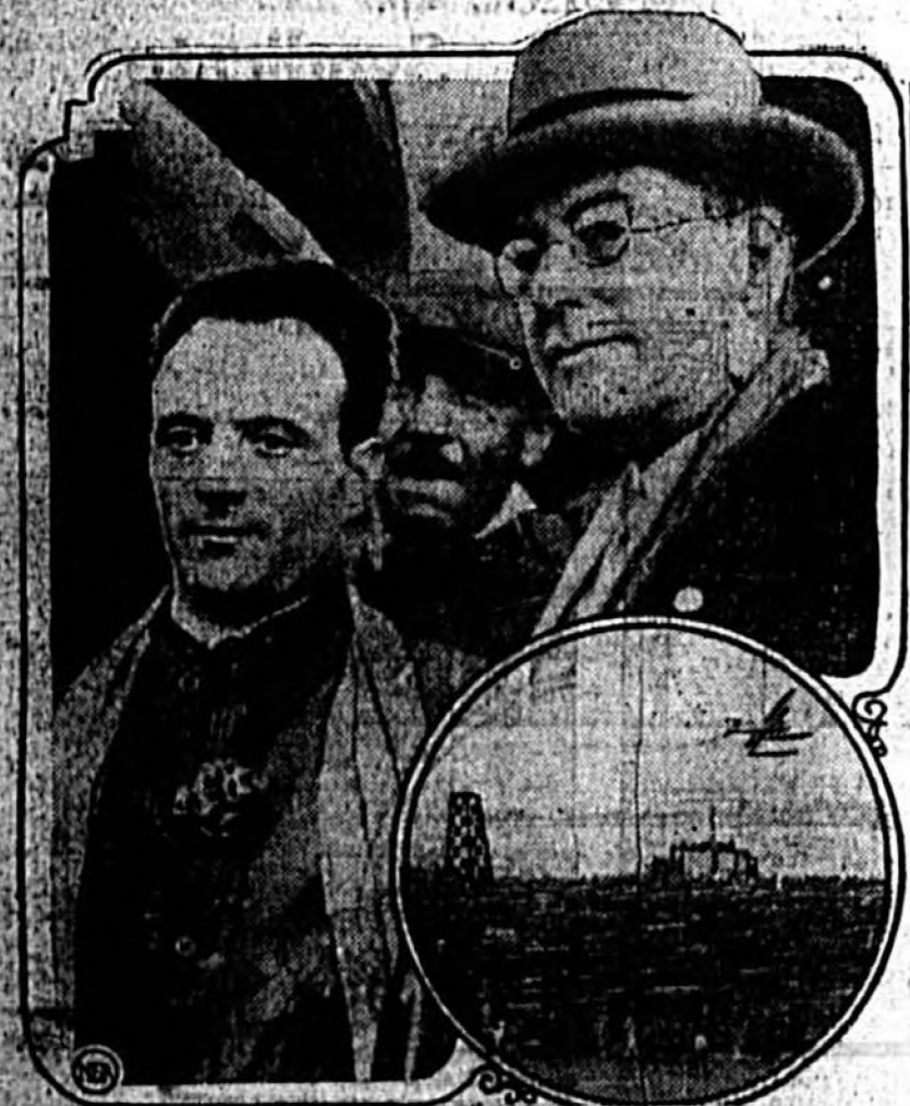
Secretary of the Navy Curtis D. Wilbur felicitating Major Mario de Bernardi, Italian aviator, after he set a new seaplane speed record of 240 miles an hour in defeating the Navy's foremost pilots in the Schneider Cup Race at Hampton Roads, Va. By de Bernardi's victory, Italy gained permanent possession of one of aviation's most cherished trophies. In the inset the winning plane is shown banking around the home pylon.