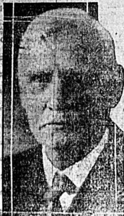
Congressman Thomas S. Butler, of Chester, Pa., father of Gen. Smedley Butler, holds the congressional record for successive elections. His constituents have sent him to Washington for 16 terms in a row. Only one other member—Representative Cooper—has served in the House longer than Butler.