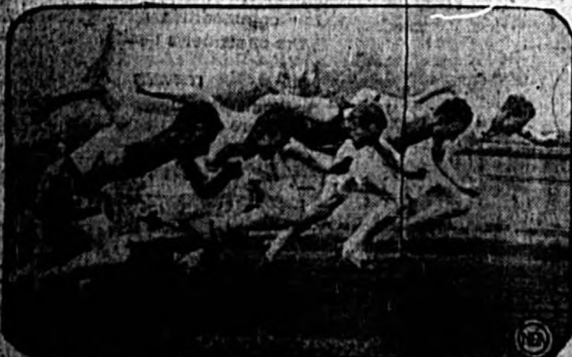
"Bang!"—and they're off! Perfect symmetry of mind and muscle is pictured here. The five sprinters are Oxford University seniors, hitting the cinder track for 100 yards.