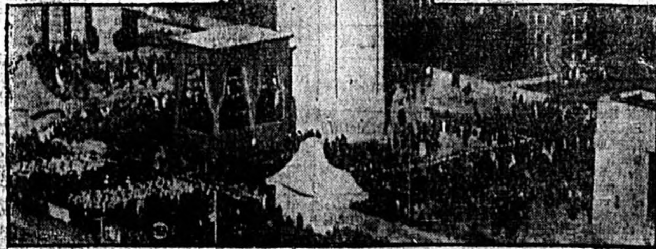
This is what Kansas City's new war memorial looked like when it was dedicated on Armistice Day, with President Coolidge addressing more than 100,000 people. The speaker's platform, from which he spoke, can be seen at the base of the towering shaft. This picture was taken in the middle of dedicatory ceremonies.