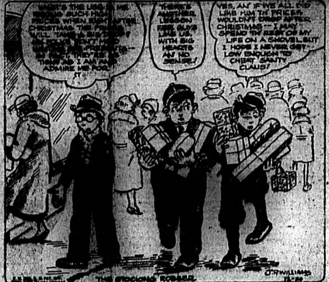
THE STOCKING ROBBER