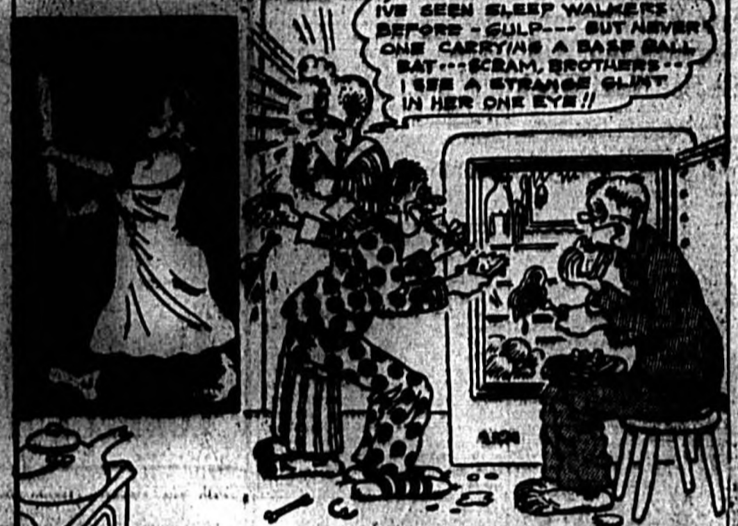
THE MIDNIGHT RAIDERS AT MRS. SULPHURO BRIMSTONE'S BOARDING HOUSE ARE SEEING THINGS AT NIGHT