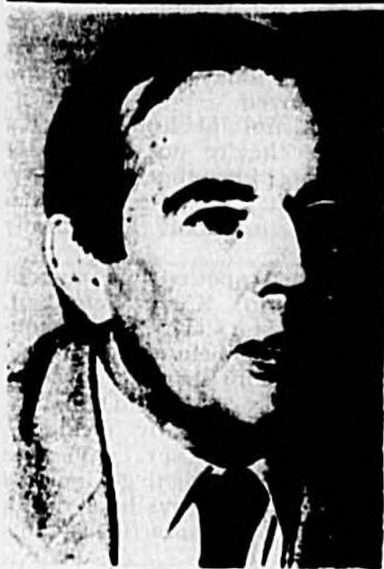
Dr. Christiaan Barnard

But when he went to see the girl, asked her what was wrong and she replied, "I have a broken heart," he left the room in tears and scheduled surgery. He studied her exposed heart for almost half an hour before it occurred to him how he could reconstruct it. The girl went on to live a normal life.