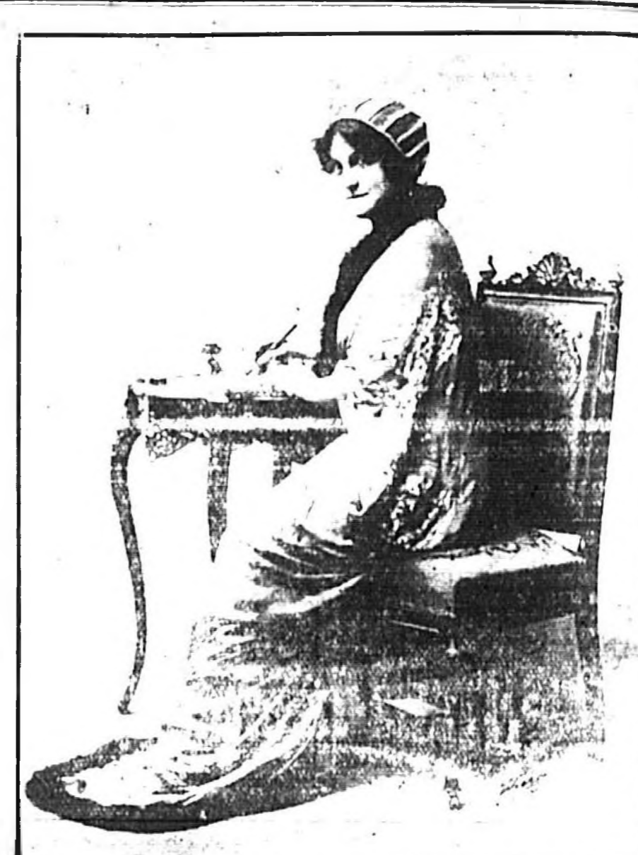
A Scene From "Fighting Hope" at the Star Friday, November 19th