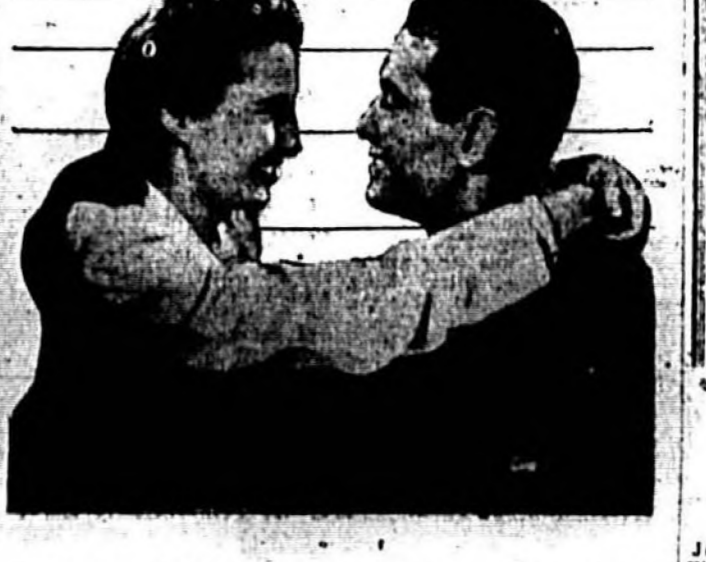
BARBARA STANWYCK and Henry Fonda are shown here in a scene from "You Belong to Me," the hilarious comedy of a job with too many friends, which will be the screen attraction next Wednesday and Thursday at the Ritz Theater. Edgar Buchanan, Roger Clark and Ruth Donnelly head an impressive cast.

Theater Program For Week of Mar. 1 Monday, Monday, MON GREEN WAS MY AUNT Tuesday, Tuesday, TUE THREE MEN AND A CRUCIFIX Wednesday, Wednesday, WED THE RAGING TIDES Thursday, Thursday, THU YOU BELONG TO ME Friday, Friday, FRI THE RAGING TIDES Saturday, Saturday, SAT THE RAGING TIDES Sunday, Sunday, SUN THE RAGING TIDES