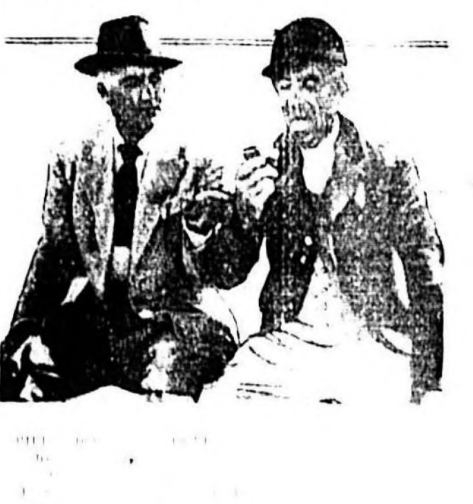
DENNIS O'KEEFE, Philip Reed and Jane Wyatt are shown here in a scene from "The House of Wax," the gripping story of a man who builds a house out of wax. It will be the screen attraction next Wednesday and Thursday at the Ritz Theater.