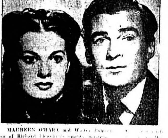
MAUREEN O'HARA and Walter Pidgeon are shown here in a scene from "The Sea Hawk," the epic of Richard Hakluyt's adventures, which will be the screen attraction next Wednesday and Thursday at the Ritz Theater. Edgar Buchanan, Roger Clark and Ruth Donnelly head an impressive cast.

Theater Program For Week of Mar. 1 Monday, Monday, MON GREEN WAS MY AUNT Tuesday, Tuesday, TUE THREE MEN AND A CRUCIFIX Wednesday, Wednesday, WED THE RAGING TIDES Thursday, Thursday, THU YOU BELONG TO ME Friday, Friday, FRI THE RAGING TIDES Saturday, Saturday, SAT THE RAGING TIDES Sunday, Sunday, SUN THE RAGING TIDES