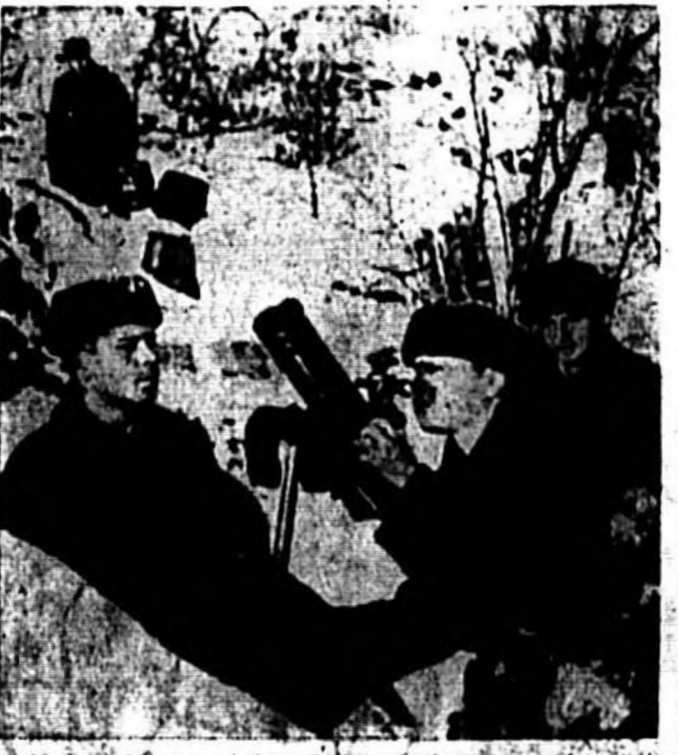
Death is now drifting toward German soldiers who are retreating against the retreating Nazis somewhere on the northern Russian front. Latest reports from Moscow declare a German army south of Leningrad smashed with other Nazi forces around the beleaguered city in peril of encirclement.