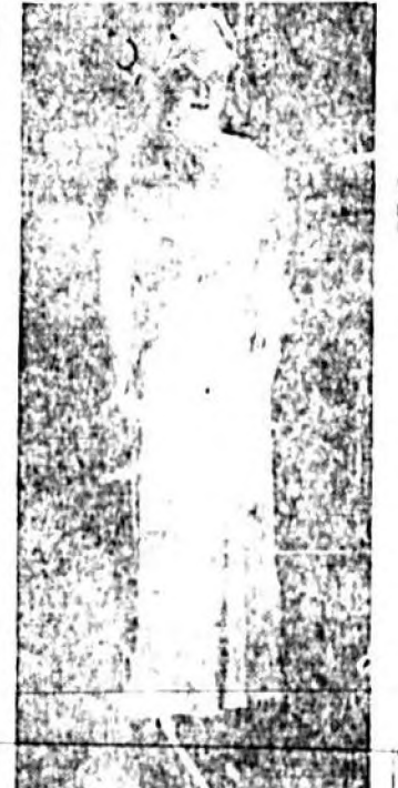
NEWEST SHIRTS. An enchanting two-color dress from St. John's, in a new soft silk crepe called Orlon, with deep cape across front with long Evening extending over the hips in two long points.