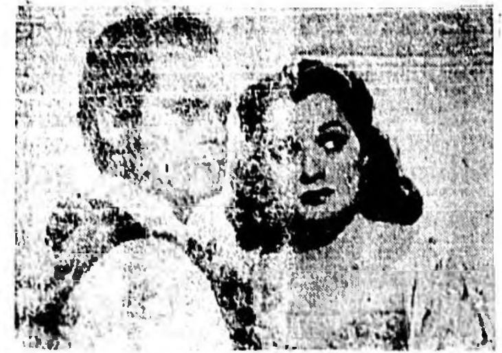
At the wedding of Larry Parks and Ellen Drew in 'The Swainsboro'... A colorful picture in Technicolor with George Macready at the helm. Theaters: Curlews and Friday.