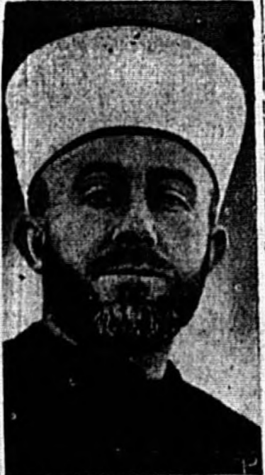
GRAND MUFTI of Jerusalem, Haj Amin el Hussein, a personal friend of Adolf Hitler, is reported to have landed at Damascus in a plane from France. A huge crowd of Arabs were on hand to greet him at the Syrian airport. The mufti, seven years exiled, was scheduled to address the powerful Arab League, at nearby Bludan.