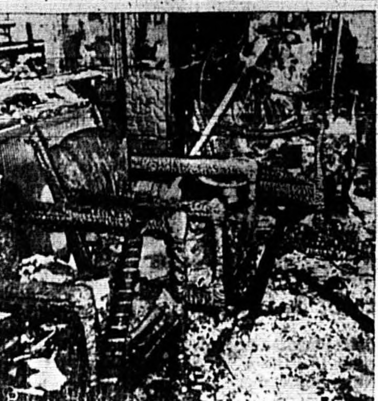
CHARRED REMAINS of furniture stand in mute testimony of the disastrous blaze which swept through the Canfield Hotel at Dubuque, Iowa, claiming the lives of at least 15 persons. Twenty-three persons were still accounted for in the hotel fire, worst in Iowa's history. Red Cross officials reported twenty-one injured.