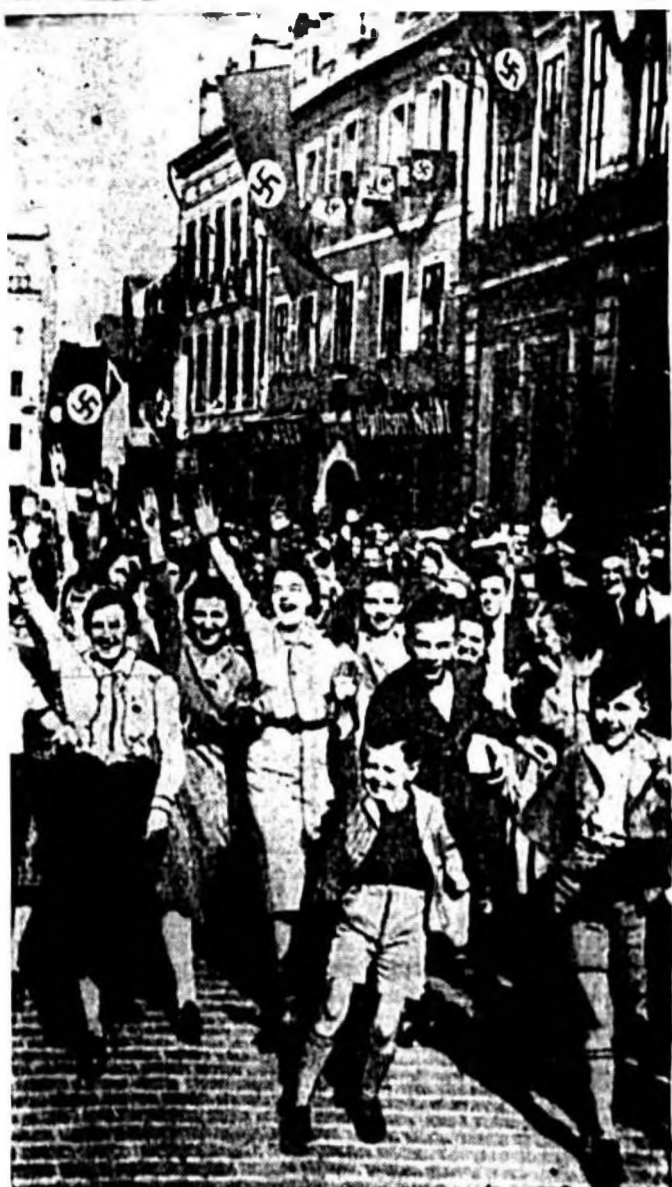
Residents of Asheville, Czechoslovakia, and Carpathian of Romania, marching through the streets of the city, celebrating the second anniversary of the fall of the Berlin government. They are carrying flags and banners, and the atmosphere is one of joy and triumph.