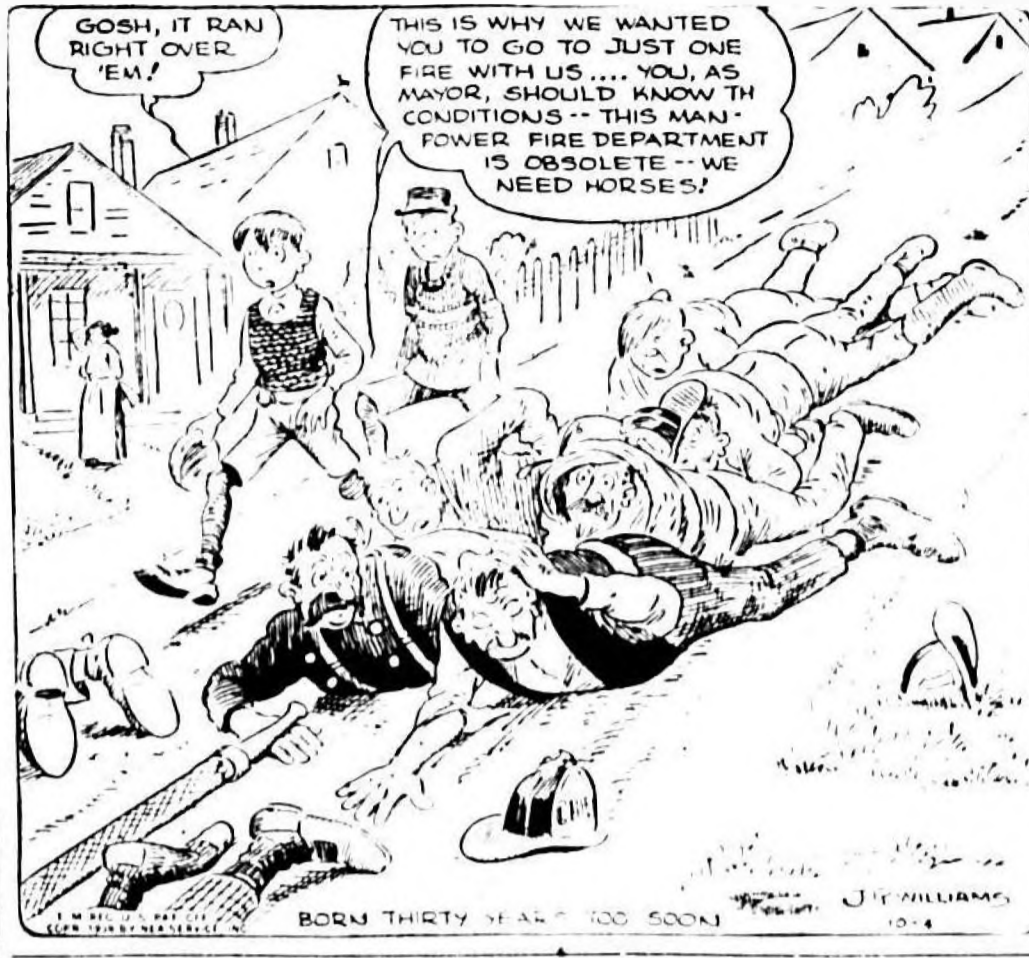
BORN THIRTY YEARS TOO SOON