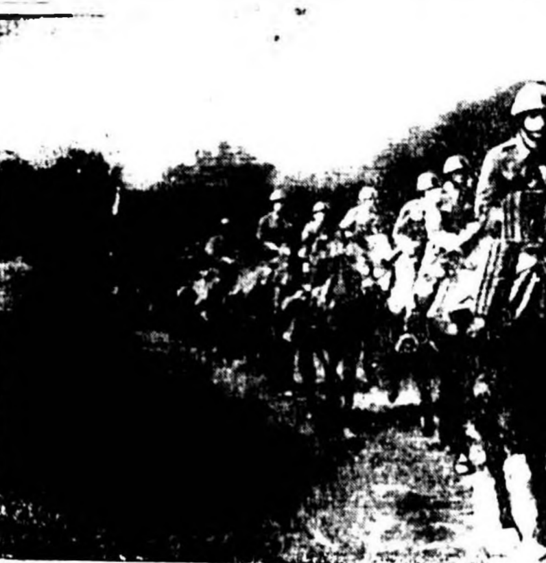
The radiophone, transmitted from the Czech border, showed the withdrawal of Czech troops from the border area. The soldiers are seen moving across the field, and the atmosphere is one of quiet activity.