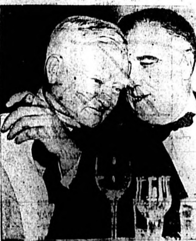
President Roosevelt, stressing Democratic party harmony at the annual Jackson Day dinner in Washington, whispers a confidential word to Vice President Garner.