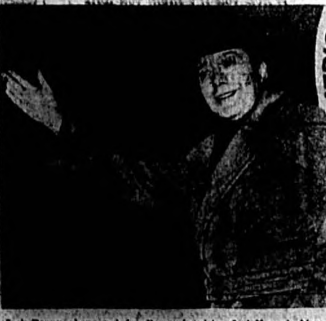
Jack Benny, above, noted radio comic, pictured at Newark Airport after his indictment on three counts of smuggling by a New York federal grand jury. Benny said he had no intention of violating the law.