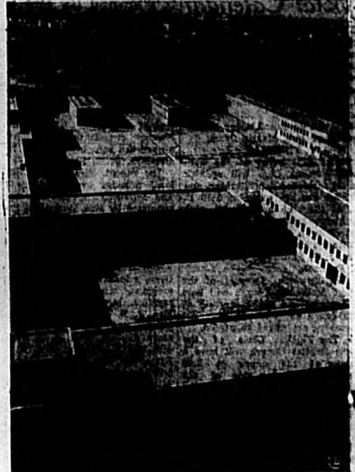
Al Capone, one-time No. 1 gang overlord, was secretly transferred from Alcatraz Island to San Pedro's Terminal Island Prison, pictured above.