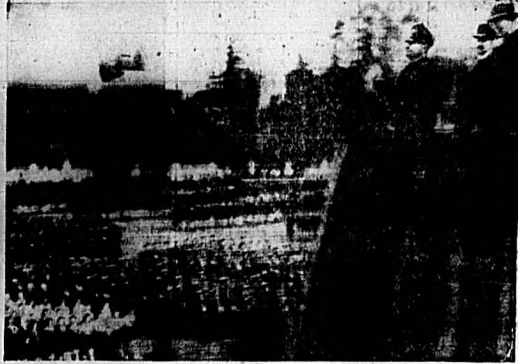
THIS PHOTO which was sent to New York by radio and transmitted by Acme Telephoto shows Premier Mussolini, Prime Minister Neville Chamberlain and British Foreign Secretary Lord Halifax as they reviewed gymnasts in Rome Jan. 12.