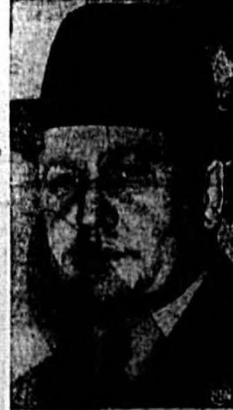
Incensed at desertion by his wealthy friends, Alvin Karpis, convicted in New York federal court on charges, was reported to "tell all," naming persons.