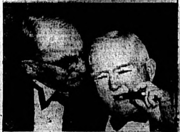
A guy who gets around is House Speaker Bankhead, pictured working out on Postmaster General James Farley's veterans and lower, giving the same treatment to Vice President Garner.