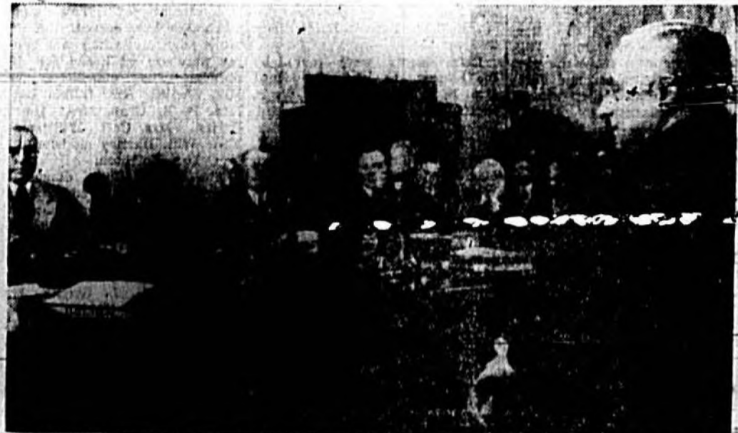
THIS SUB-COMMITTEE of the Judiciary Committee of the United States Senate approved the qualifications of Professor Felix Frankfurter for confirmation to the United States Supreme Court. Shown, left to right, facing the camera are Senators Reilly, Morris, Austin and Hughes. Frankfurter is shown, during his appearance on the stand at the extreme right.