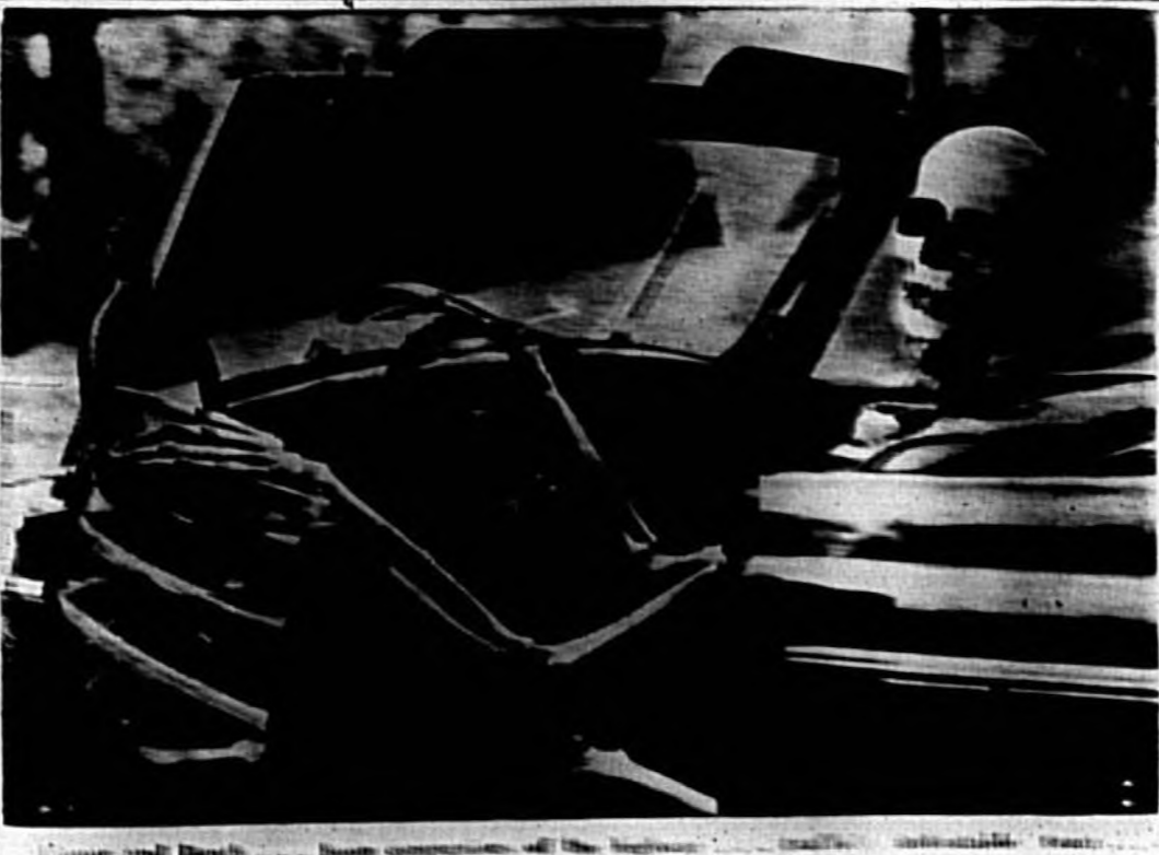
Business and health are the two main concerns of the business men of Sanford. They are looking for ways to improve the city's business and health conditions.