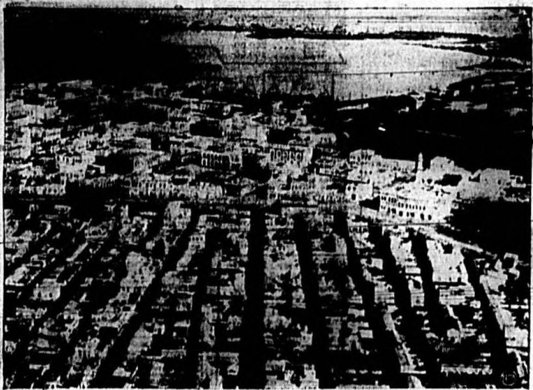
White and glistening in the African sunlight lies the rich French-owned port of Djibouti, prominent in Italian chambering for colonial territory now owned by France. The Mussolini-Chamberlain meeting at Rome will pay considerable attention to this important metropolis.