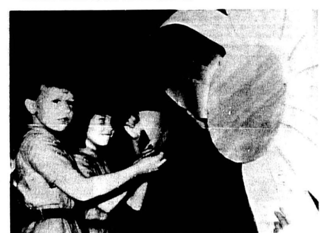
BROWNIES bring their donation to Juliette Low World Friendship Fund and attach their petal on the daisy in ceremony that launched Girl Scout Week Sunday.