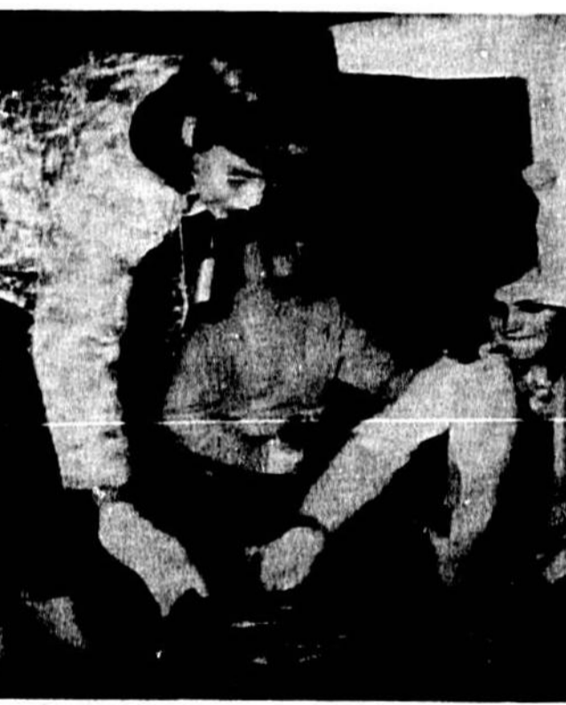
POPCORN adds to campfire fun for girls of Troop 623, Tanglewood.