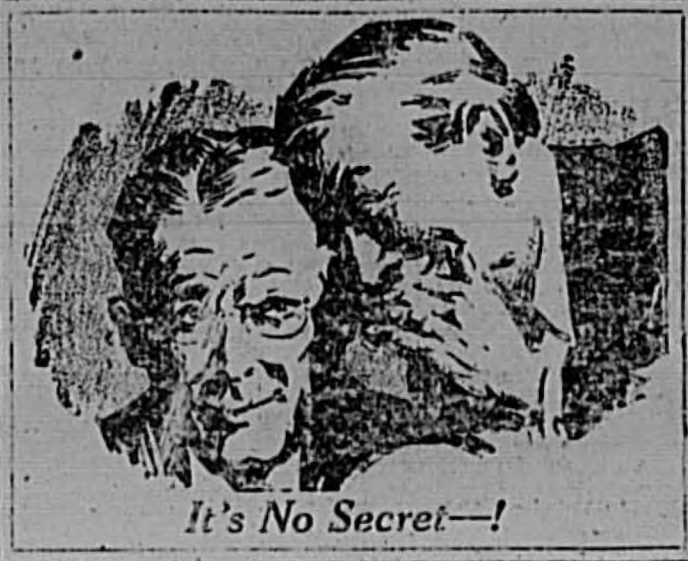
It's No Secret—!