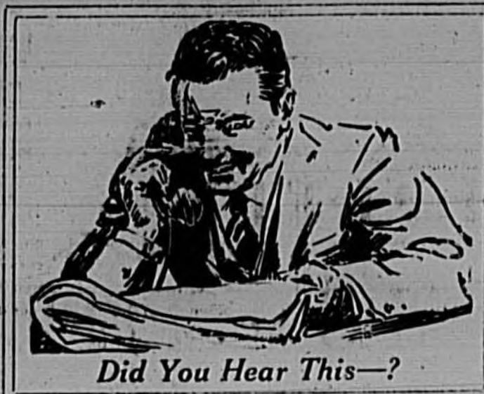
Did You Hear This—?

IN JUSTICE TO YOURSELF AND FAMILY — DONT MISS IT!!