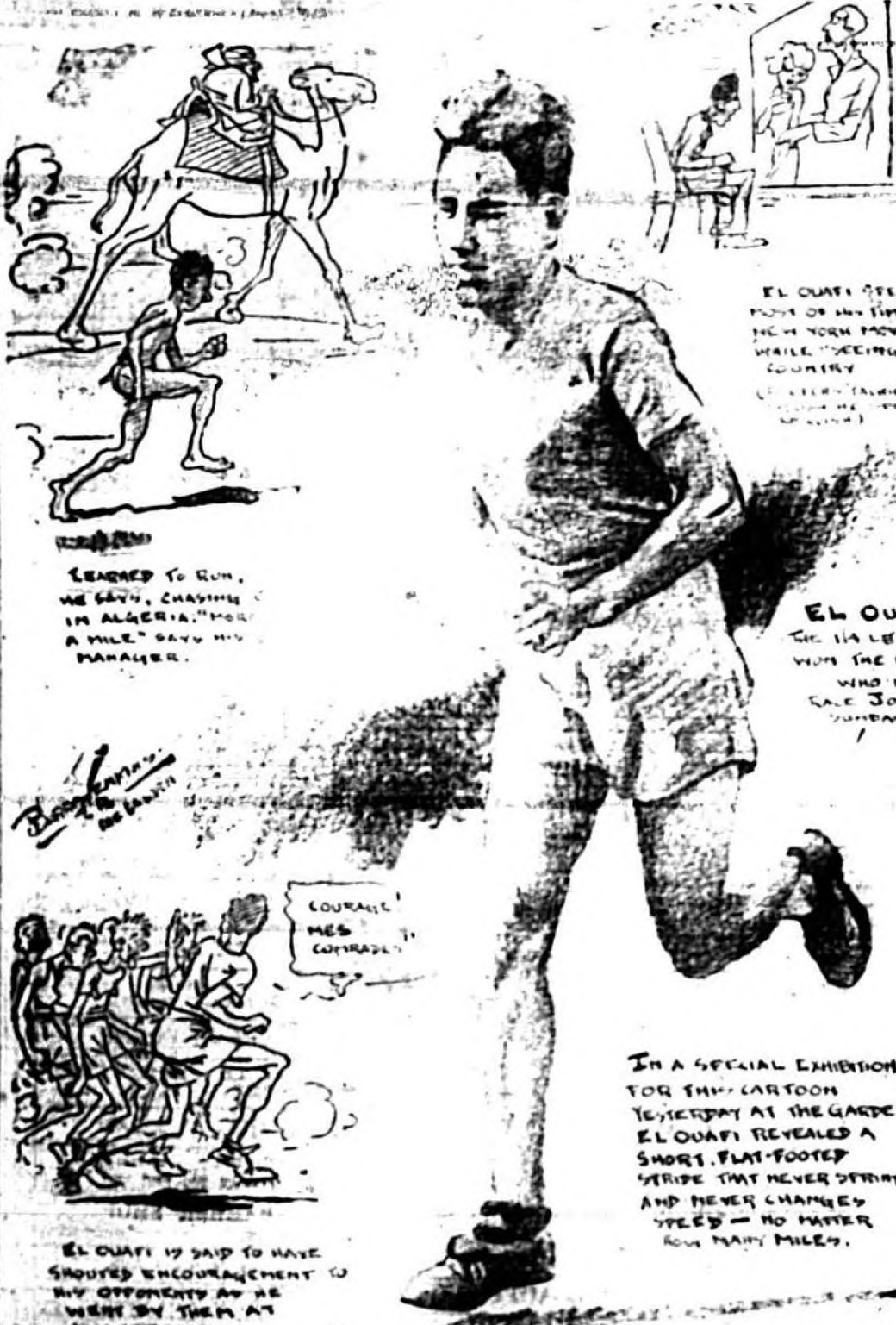
LEARNED TO RUN, WE SAY, CHASING IN ALGERIA. "MORNING" A WHILE. "MORNING" A WHILE.