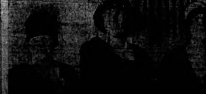
Mrs. Hoover is seen here at a breakfast event for the wives of engineers. She is surrounded by other women and is engaged in conversation.